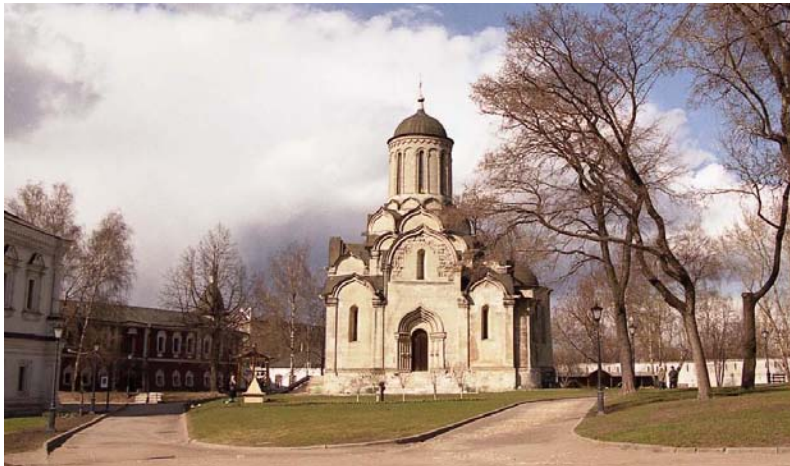
Figure 1 The Saviour Cathedral of the St. Andronicus Monastery in Moscow