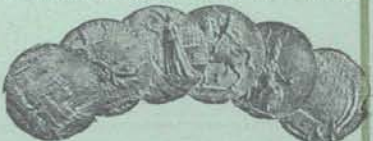
Gold Medal (Highest Award), Allahabad 1910.

GRANDS PRIX: Paris 1900, Brussels 1910, Buenos Aires 1910