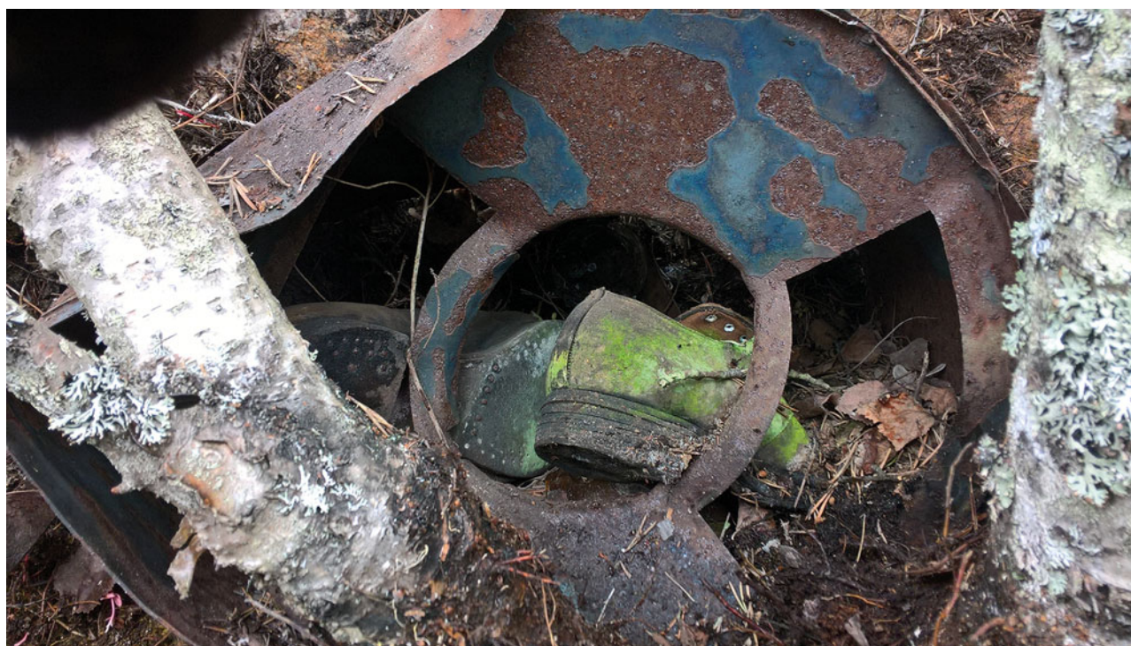
Figure 8. Women's shoes placed inside a wartime stove.

of PoWs and their harsh treatment, which disturbed local people, and perhaps explains why PoW camp sites have a particular 'haunting potential', with memories and places becoming entangled so as to make them experientially disturbing.