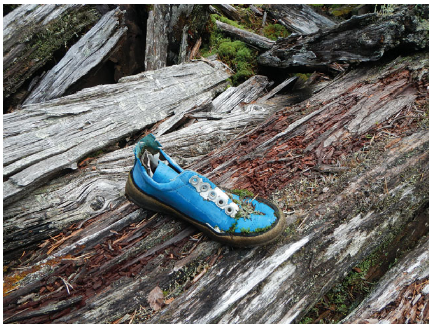
Figure 6. Post-war child's shoe found wedged under the corner logs of a PoW log house at Inari Haukkapesäoja.

which also takes us back to Haukkapesäoja that produced the child's shoe placed underneath the corner of a PoW house and the 'bone bundle' from the PoW dump at a border of the camp. If Ikäheimo et al. (2016) are correct in their interpretation of the Oulu memorial site, the bone bundle from Haukkapesäoja could be interpreted as an analogous 'spirit trap', intended to pacify a locally ill-reputed site. The shoes from Hyljelahti and Haukkapesäoja echo a different but related folk tradition, in which shoes have been assigned special cultural meanings due to their 'liminal' character. Shoes are artefacts between self and the world, and they are 'imprinted' materially with the footmark of the user and the personality of their wearer, which make them distinctively personal artefacts (Randles 2013; Swann 1996).