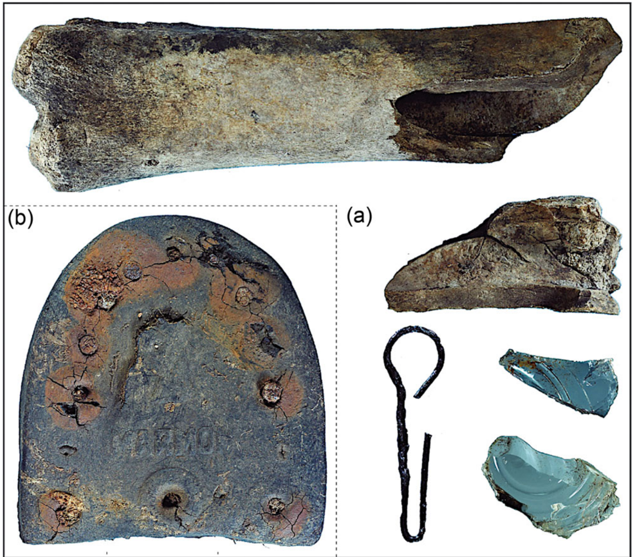
Figure 5. Finds uncovered at the base of the Taavetti Lukkarinen hanging-tree. (a) The bone and the finds concealed inside it; (b) The shoe sole that capped the bone deposit. (Illustration: Emilia Jääskeläinen. Ikäheimo & Äikäs 2018, 102.)

have been an important and valued sacrificial item throughout much of the history of the Sámi sieidi , attested by sources since the sixteenth century (Olaus Magnus [1555] 1998). While the boulder at Hyljelahti is not a sieidi , this comparison helps to put the site in a broader historical context of northern human–environment relations, instead of regarding it merely as an isolated curiosity.