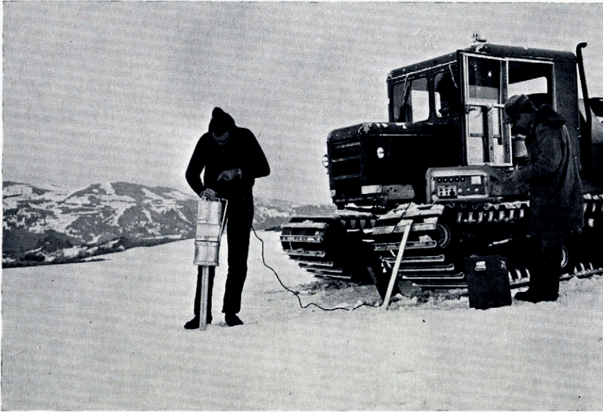
Fig. 2. Neutron probe in use, showing over-snow vehicle used for winter access to remote locations

status with time rather than on the absolute water content of the profile. Neutron probes are well suited to this type of analysis. The same soil mass can be measured repeatedly, so losses or gains can be determined for each sampling point. Analysis of changes at specific locations automatically introduces a covariance between measurements made at the same point at different times, and so reduces experimental error. Moisture changes, being numerically less than total water content, give a smaller error in terms of moisture volume or inches of water per foot of soil than if the total water content of the profile is evaluated. For a given precision level, an analysis of changes requires only about one-tenth as many samples as a total moisture survey (Douglass, 1962).