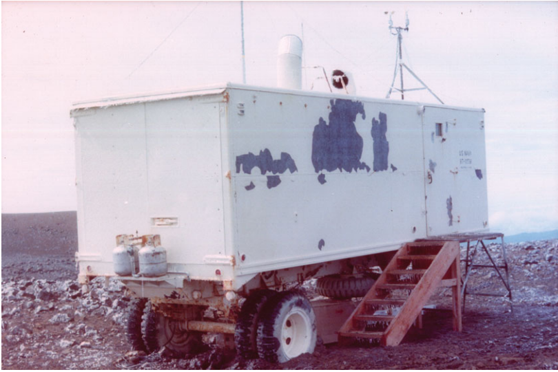
Figure 3. Him's "home", 1966.