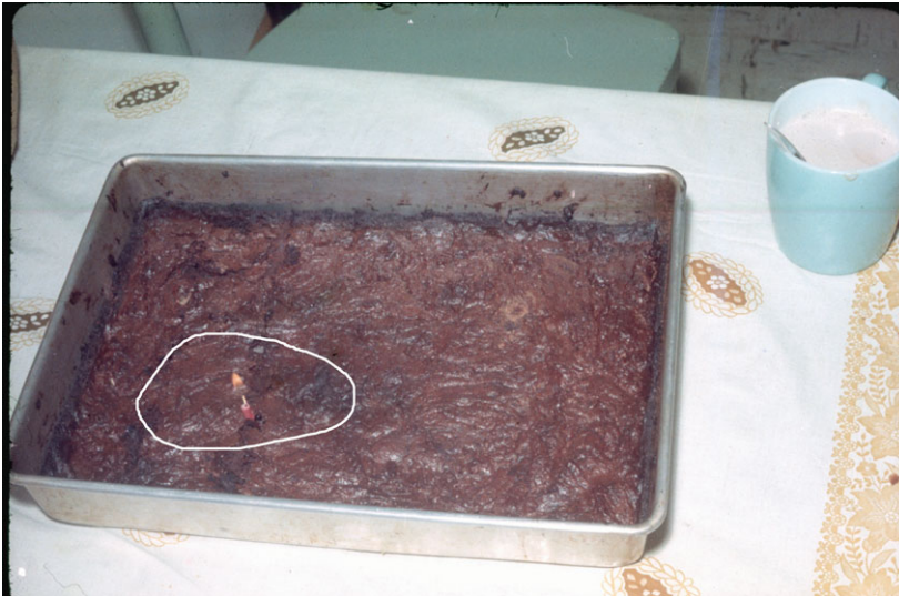
Figure 4. High-altitude brownies, 1966.

Building the summit road required more ingenuity than baking birthday brownies, but Harwood and his colleagues persevered.