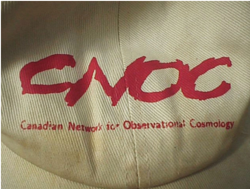
Figure 6. Canadian Network for Observational Cosmology.