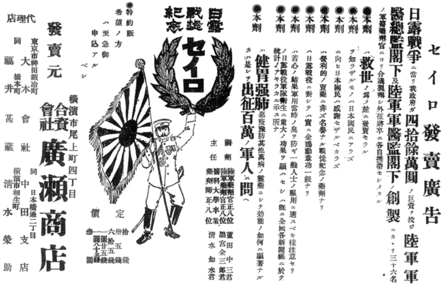
Figure 1: Yakugyō jihō, 1 November 1906.