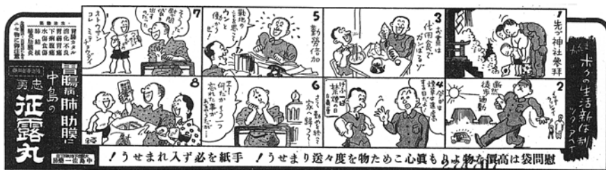
Figure 7: Osaka Asahi Shinbun , 2 November 1940.

commercial exhortations? Unfortunately, there are no official sales figures available from the 1930s and the first half of the 1940s, but we can ascertain the enduring success of the drug from circumstantial evidence.