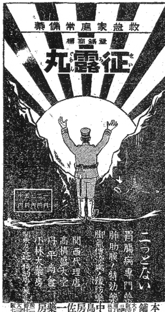
Figure 3: Yomiuri Shinbun , 24 December 1923.

The Russians might have been satisfied with this solution, but it was not the end of Chūyū-Seirogan , let alone the term Seirogan . Unlike what the Ministry of Foreign Affairs insinuated to the Soviet embassy, the court ruling of 28 June did not prohibit the manufacturing and selling of the drug itself; rather, what it specified was the cancellation of the trademark only, based on the fact that Seirogan was a commonly accepted name, thus ironically making the name Seirogan available to anyone. Nakajima Drugstore did not, however, resume its marketing campaign immediately after the unintended acquiescence of the government. On the one hand, it was prudent for them to wait until the dust settled. But, more significantly, they must have realised (rather belatedly) that with the overall social sentiment of the Taishō period, with its emblematic dedication to democracy and internationalism, it was not favourable for them to market a drug that was based solely upon the mythic image of Japanese soldiers during the war that had ended twenty years earlier.