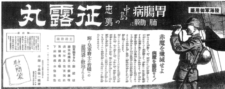
Figure 5: Osaka Asahi Shinbun, July 20, 1939.