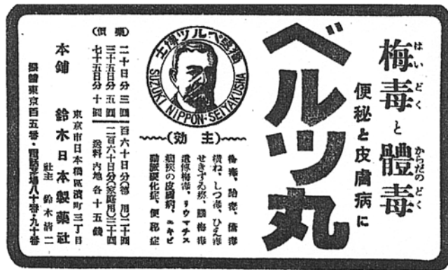
Figure 4: Osaka Asahi Shinbun , 8 April 1938.

cured such diverse diseases and symptoms as syphilis, intoxication, constipation, and general fatigue.