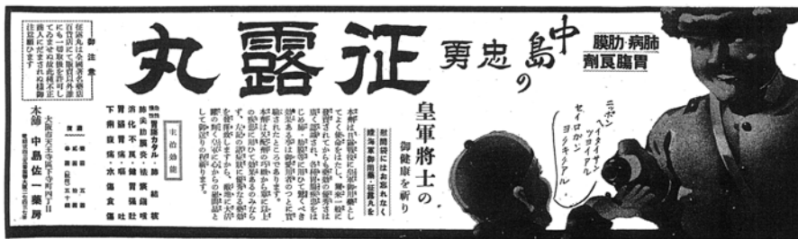
Figure 6: Osaka Asahi Shinbun, 17 February 1937.

(1600–1868), perceptions of Russia in Japan were anything but positive; whereas the Dutch and other Europeans were perceived in light of their religious and intellectual challenges, Russians, due to their geographical proximity to Japan, were predominantly portrayed as menacing intruders. 52 This negative image of Russia was further amplified and reinforced during the course of the Russo-Japanese War. In the process of creating and propagating a favourable image of Japan both within and without the Japanese archipelago, the Japanese authorities, often with the explicit support of American and British press, successfully demonised their enemy. 53 The subsequent Sovietisation of Russia further denigrated the image of Russia among the Japanese. And the Nakajima Drugstore did not hesitate to co-opt the widely recognised image of the Soviet demon. As is seen in the advertisement posted in Osaka Asahi Shinbun on 20 July 1939, communism personified by the Soviet Union was a ‘red demon’ ( aka-ma in Japanese) that Japan was ‘heavenly mandated’ to destroy (Figure 5). Rhyming with the call for action against communism was the exhortation to destroy the ‘disease demon’ ( byō-ma ) by using a drug, Seirogan . The comparison cannot be misunderstood – just as imperial Japan was destined to destroy the ‘red demon’, Seirogan was invented to kill the ‘disease demon’.