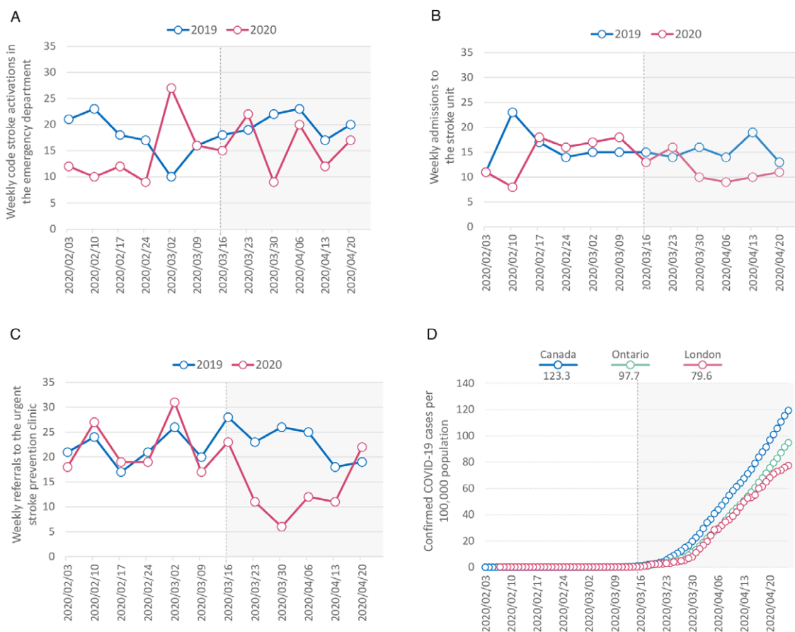
Figure 1: Weekly stroke team activations and urgent stroke prevention clinic referrals. Panel A: Weekly code stroke activations in the ED. Panel B: Weekly stroke admissions. Panel C: Weekly referrals to the urgent stroke prevention clinic. Panel D: Confirmed cases of COVID-19 in London, Ontario, and Canada per 100,000 population since February 3, 2020. The vertical line represents the date of the provincial lockdown and the shades show the time window thereafter.

because this is the first day of WHO epidemiological weeks and it also allows for mitigating the bias of weekdays vs. weekend consults. We used the same WHO epidemiological weeks of 2019 as a comparator. We compared epidemiological weeks of 2020 vs. 2019. These are matched weeks in both years, which are used for mitigating the bias of seasonal variations in stroke consults. Code strokes included patients brought to the ED by the Emergency Medical Services and walk-in strokes. Additionally, we quantified hemorrhagic and ischemic stroke admissions to the stroke unit and referrals to the urgent stroke prevention clinic during the same period by reviewing the London Ontario Stroke Registry, the inpatient census, and London Health Sciences Centre’s electronic booking system. The stroke registry is updated on a real-time basis. Clinic referrals consist of patients with minor strokes or transient ischemic attacks (TIAs).