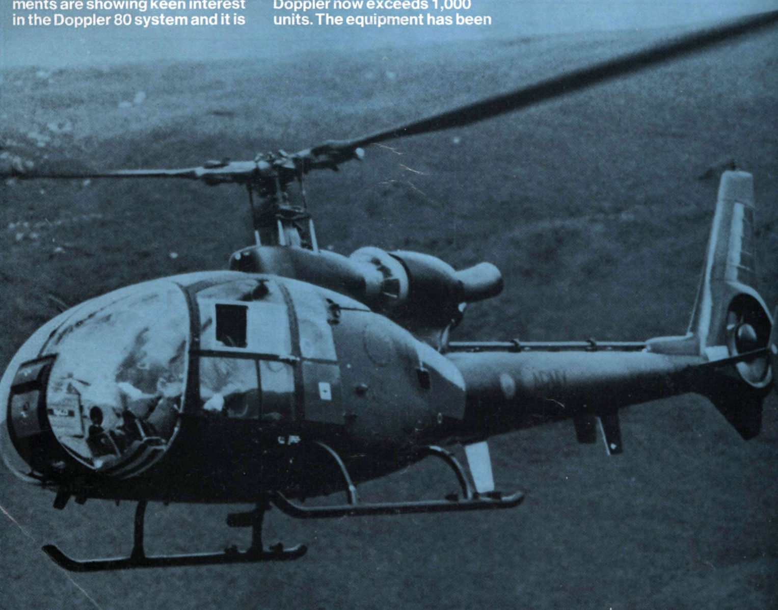
A Decca Doppler 80 equipped Westland/Aerospatiale Gazelle helicopter.

The Doppler 80 system has been designed specifically as a complementary system to the 70 series and will meet the operational requirements of small helicopters where cost, size, ease of installation and light weight are of paramount importance.