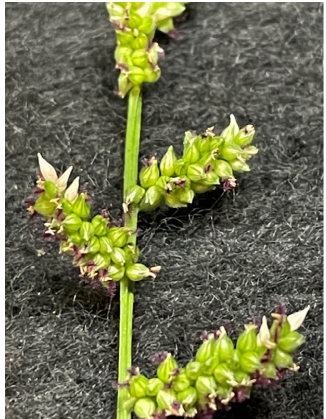
Figure 1. Ongoing pollination of a barnyardgrass inflorescence.

PMGF and the spread of HR weeds into new agroecosystems is a concern because it introduces new HR alleles into weeds and makes them difficult to control with herbicides (Jhala et al. 2011; Jhala and Hall 2013). Beckie et al. (2019) reported that PMGF from HR crops has been extensively studied; however, PMGF from HR weeds is understudied. Jhala et al. (2021) reviewed PMGF from economically important HR broadleaf weeds to susceptible weeds; however, a comprehensive review of the scientific literature on PMGF from HR grass weeds has not been collated. The objective of this article was to review reproductive biology, HR biotypes, and the potential for herbicide resistance allele transfer via pollen from economically important and widely distributed HR grass weeds, including barnyardgrass, creeping bentgrass, Italian ryegrass, johnsongrass, rigid ryegrass, and wild oats ( Avena fatua L. and Avena sterilis L.).