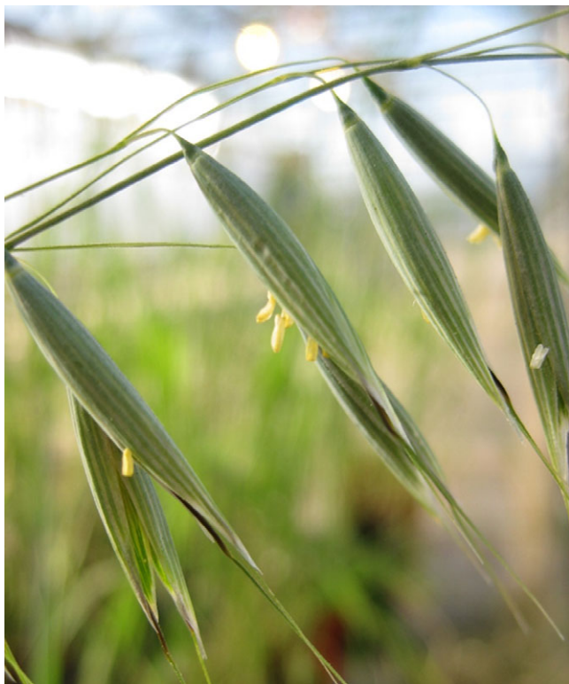
Figure 8. A wild oat panicle during anthesis with yellow anthers visible on some of the florets.

compared with those favored by A. fatua (Stace 1997). In addition, A. sterilis can grow under drier conditions than A. fatua (Fernández-Quintanilla et al. 1990; Thurston 1951).