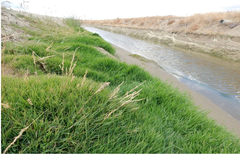
Figure 2. Glyphosate-resistant creeping bentgrass established on an irrigation canal in 2016 near Ontario, Oregon.

(Bradshaw 1958). Many of the hybrids are fertile; even if sterile, the plants will likely persist because the parent species are perennial and reproduce vegetatively.