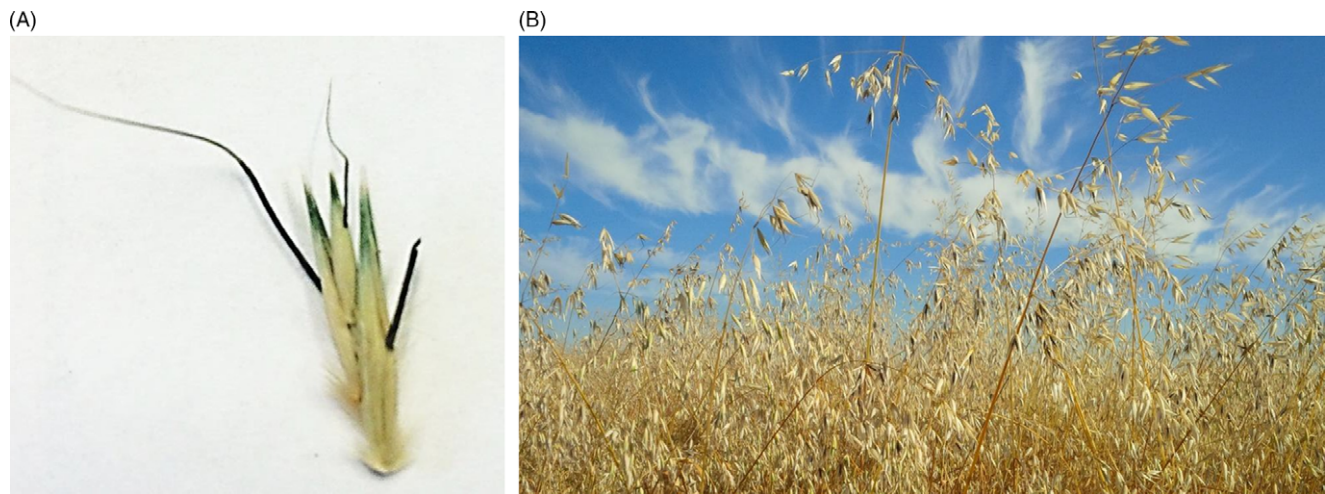
Figure 7. (A) Wild oat ( Avena fatua ): three florets/seeds and (B) wild oat mature plants in a crop canopy.