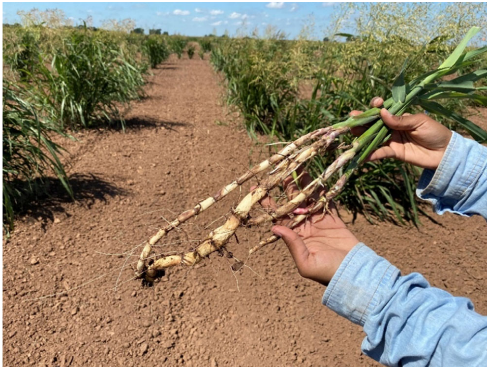
Figure 5. Vigorous rhizome production by johnsongrass in a field study conducted at College Station, Texas.

counties in Arkansas and found resistance in two accessions for glyphosate or imazethapyr. Riar et al. (2011) confirmed glyphosate resistance in a johnsongrass population collected from a field near West Memphis, AR, that had been under continuous soybean production for at least 6 yr with frequent use of glyphosate. This