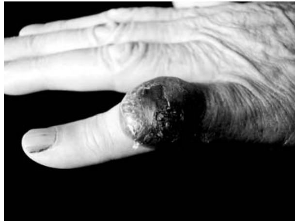
Fig. 4. Case 3. The appearance of the lesion at day 41 of infection (acute stage).

evolution and resolved with no residual scarring in approximately 6 weeks. This clinical course also verified the diagnosis of orf.