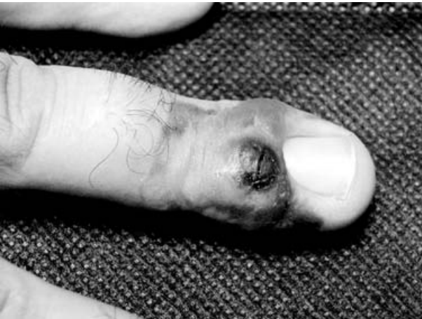
Fig. 2. Case 2. Illustration of the lesion at day 19 of infection (regenerative stage).