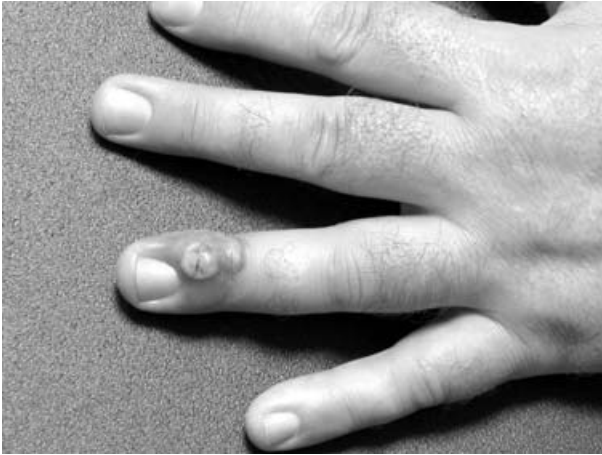
Fig. 1. Case 2. The appearance on referral day. Solitary lesion on nail fold at day 11 of infection and incision of the lesion are seen (acute stage).