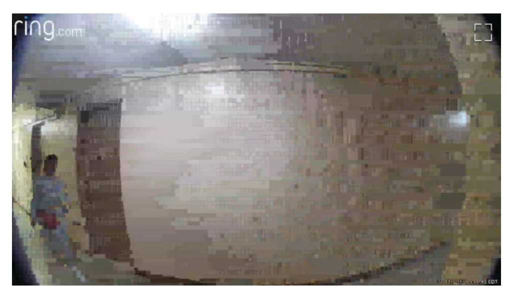
Figure 2. A corrupted video shows someone approaching before it goes blank. Still from "Ring Damage" (Neighbor 2023) from the Neighbors app.