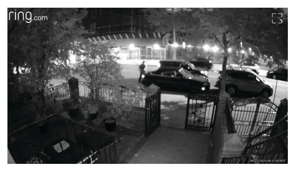
Figure 5. People who make deliveries are often imaged by Ring cameras and posted on Neighbors. Still from "Suspicious activity" (Neighbor 2022c) from the Neighbors app.

without compensating you; it just argues that you are better off inside its ideological matrix than outside it—that it will protect you by protecting your property. Your gestures recruit you into the maintenance (social, financial) of capitalist surveillance, and the surveillance scene you support estranges you so it can relocate you inside its grasp. For actors to produce a Verfremdungseffekt, Brecht proposes "not - but," a logic in which "every sentence and every gesture signifies a decision" while still showing the alternative as a possibility implied in that decision ([1951] 2014:213). With a threatening not - but , Neighbors teaches: you are not the criminal, but both the victim and the cop. You are not the criminal, but you could be, and your potential criminality remains "contained and conserved" in your gestures, your sentences, your decisions (213). You must decide, again and again, with every gesture, to play the role of both victim and cop and to report or turn in strangers to ensure that you will not become a criminal, too.