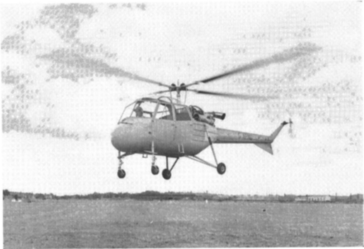
Photograph of P531