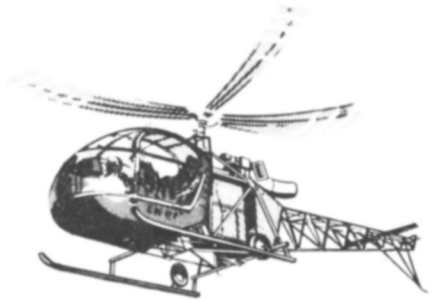
SUD AVIATION 'ALOUTTE' II