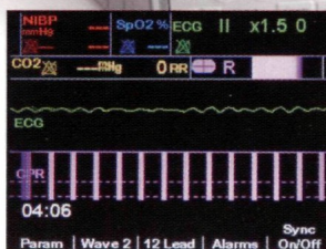
Simple, easy-to read screen with CPR feedback