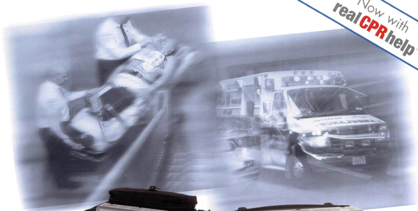
Rugged soft-pack carry case