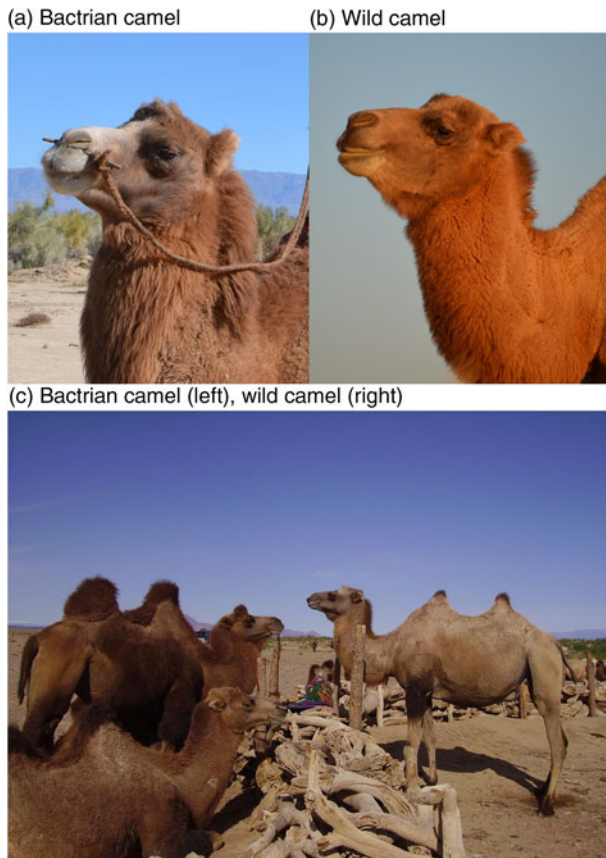
PLATE 1 Morphological differences between the Bactrian camel Camelus bactrianus , in part (a) and individuals to the left in (c), and wild camel Camelus ferus , in part (b) and individual to the right in (c). Camelus ferus has smaller, pyramid-shaped humps, a smaller body, slimmer legs and a flatter skull.