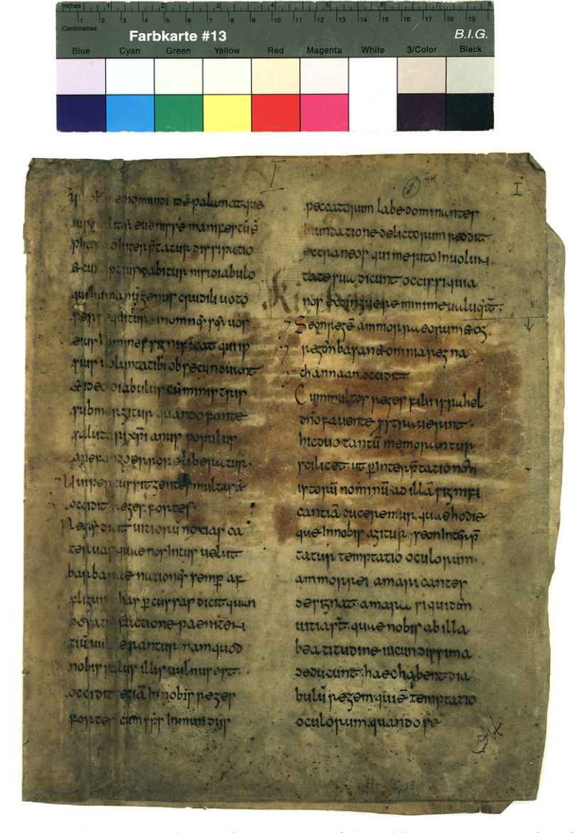
Fig. 1: Hessisches Staatsarchiv Marburg, Hr 2,19, fol. 1r. All images are reproduced with permission.