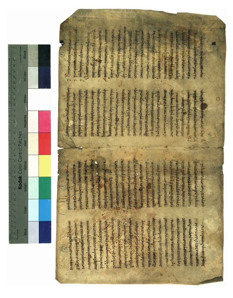
Fig. 2: Hessisches Staatsarchiv Marburg, Hr 2,19, fol. 1v-2r