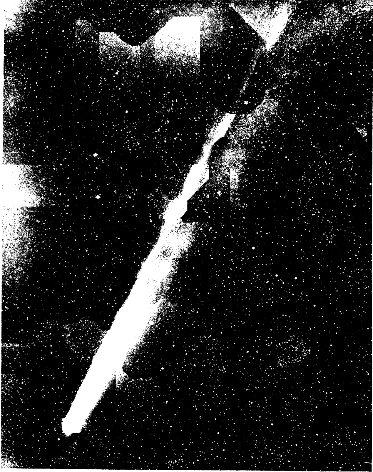
Figure 1. JOCR photograph of Comet Kohoutek on January 13, 1974. Compare with Figure 2.