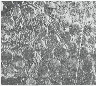
Figure 2: Carbon fibers in epoxy matrix. Sample courtesy Virginia Polytechnic Institute. 40 μm scam