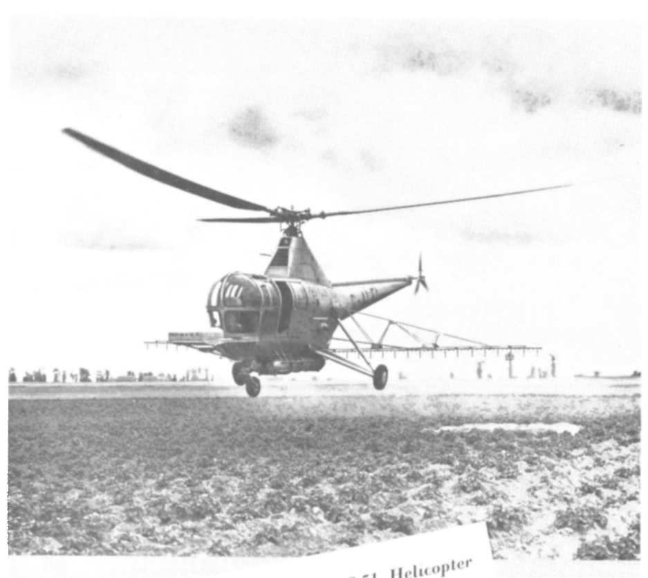
The Westland-Sikorsky S.51 Helicopter fitted with the Alvis Leonides engine