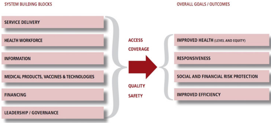
Figure 1. WHO health system framework.

interpretation of legal texts, we evaluate what the TCA, the WA and the provisions of the CTA mean for the NHS and social care across the UK. We draw on documentary data in the public domain, 23 semi-structured interviews and two online workshops, carried out under two related research projects, from February 2019 to December 2020. Ethical approval was given by the University of Sheffield (Reference 022929) and the University of Oxford (Reference R72072/RE001) (Figure 1).