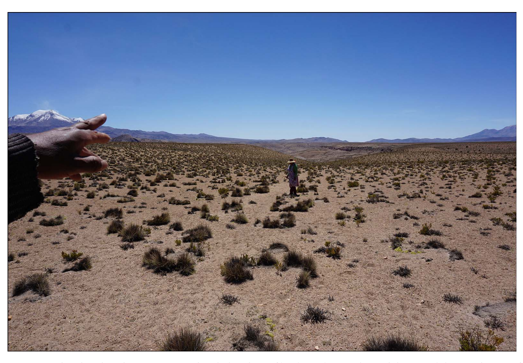
Figure 2. Abandoned road segment surveyed with the advice of local population who used them until the introduction of motor vehicles from around 1950.