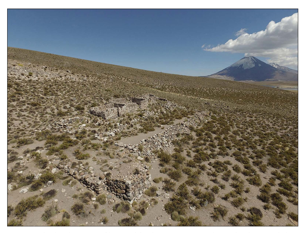
Figure 4. Archaeological excavation of houses and foundation terraces suggests that Tambo Chungara, which was registered as a Chilean national monument in 1983 for its apparently Inca architecture, is more likely a Republican building related to the establishment of the international border.