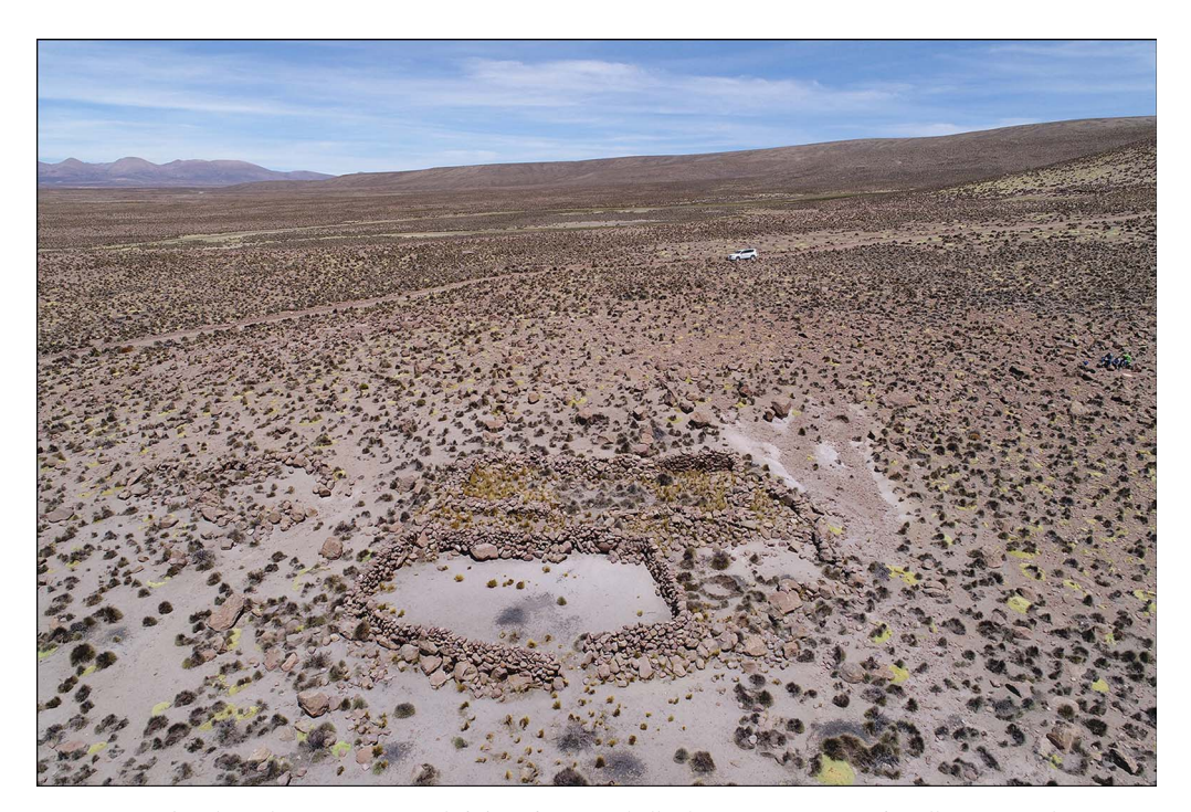
Figure 5. Archaeological excavations revealed that, despite its kallanka appearance, Tamboqollo's rectangular structure (behind the corral in the foreground) was built and used during the Colonial period.

even played a role in the formation of Criollo Republics. Thus, tambos constitute a key element for research on the history of Andean road systems, and for this reason, we carried out a comparative study of five tambos . Excavations revealed only two tambos of pre-Hispanic origin, one of which displayed Inca-style architecture. Two other sites with seemingly Inca-style architecture appear to have been established during the Colonial and Republican periods (Figures 4 & 5). The fifth site showed the coexistence of a European and indigenous tambo during the nineteenth and twentieth centuries. The sequence illustrates the complex history of this Andean institution and indicates the need for detailed archaeological research at tambo sites, which could challenge those assumptions made about their Inca or Colonial origins that are based solely on architectural appearance or ethnohistorical stereotypes.