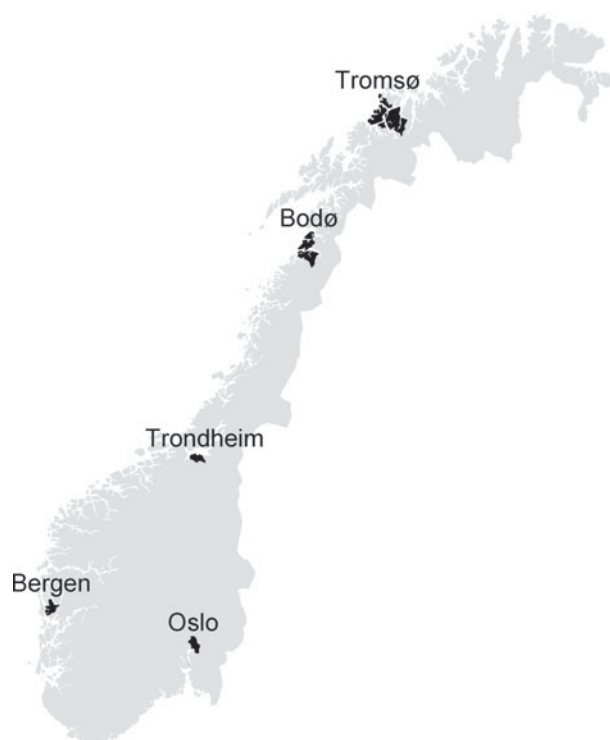
Fig. 1. The municipalities where participants were recruited. Basic map data: Norwegian Mapping Authority (cc-by-sa-3.0).

inhabitants (Statistics Norway, 2008), most elementary schools (Pedlex Norsk Skoleinformasjon, 2010) and the largest area of urban settlement (Norwegian Mapping Authority, 2010) (Table 1). Urban settlement area is defined by Statistics Norway as a hub of buildings inhabited by at least 200 persons where the distances between buildings do not exceed 50 metres. The average number of students in elementary schools in Oslo, Bergen, Trondheim, Bodø and Tromsø was 410, 320, 320, 220 and 170, respectively (Pedlex Norsk Skoleinformasjon, 2010).