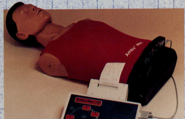
The VIP Ambu Man