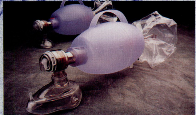
The Ambu Silicone Resuscitator