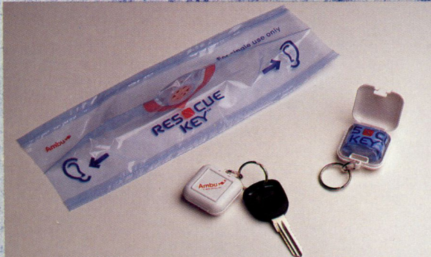
The Ambu Res-Cue Key Introduced in 1990