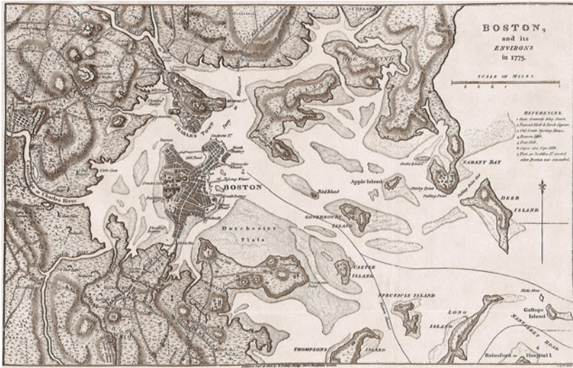
Figure 1. Boston and its Environs, 1775.

Source: Pictures Now/Alamy Stock Photo. Image ID: MM011D.