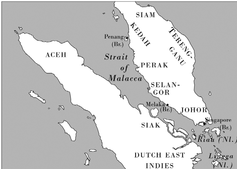
Map 3: The Strait of Malacca

As in the Indian Ocean, the Portuguese tried to establish the cartaz system in the Strait of Malacca (and other parts of maritime Southeast Asia), but they had too few ships at their disposal in order to enforce it efficiently. Meanwhile, the decline of Melaka paved the way for the rise of Aceh in northern Sumatra and for Johor in the Riau Archipelago, both of which competed fiercely for the remainder of the sixteenth century with the Portuguese and with each other for dominance in the Strait. As in the southern Philippines, maritime violence and raiding were the dominating form of warfare in the struggle for power in the Strait of Malacca throughout the early modern era.