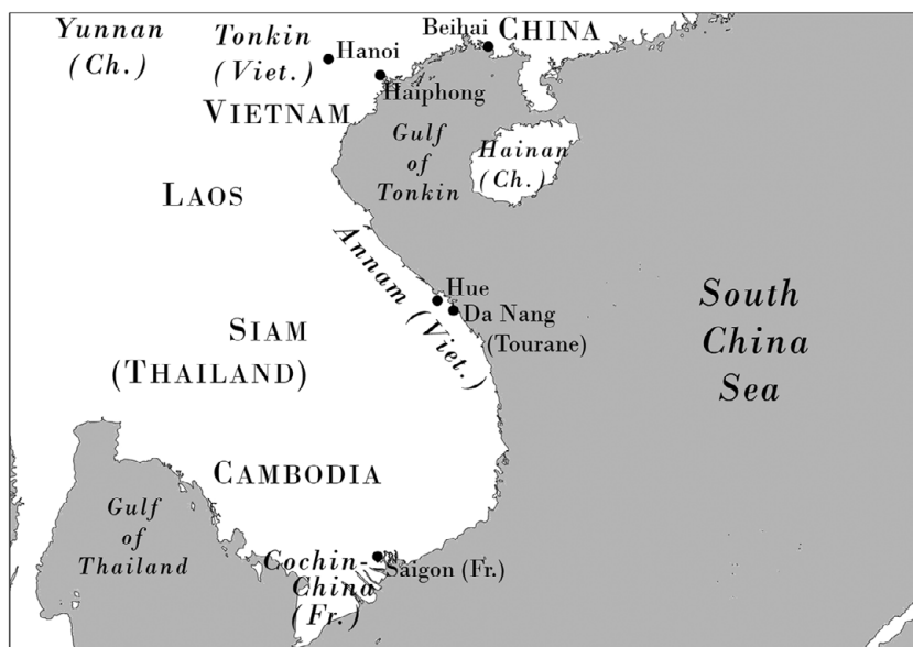
Map 4: Indochina

In order to enhance their military capacity, the Tay Son leaders enlisted the support of maritime mercenaries, mainly of Chinese origin. In European sources these mercenaries were usually called ‘Chinese pirates’, but arguably they were more akin to what Europeans called privateers. The Tay Son provided the Chinese raiders with official recognition, land bases and markets in exchange for military and financial support. This accommodation led to the development of a plunder-based economy in which Chinese raiders constituted the backbone of the Tay Son’s maritime forces and contributed substantially to the revenues of the regime. Under the protection of the Tay Son, the raiding bands thus thrived and grew in size and strength. After the rebellion collapsed in 1802 the raiders lost their official support but continued to engage in piratical activities, and the vast fleets were still for several years a formidable maritime force in the South China Sea and the Gulf of Tonkin. 4