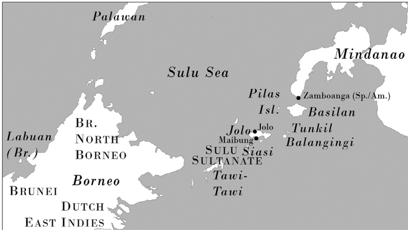
Map 2: The Sulu Sea

kingdoms to expel Muslims from the Iberian Peninsula from the eleventh to the fifteenth centuries. The Spanish consequently labelled their Muslim adversaries in the Philippines ‘Moros’, a condescending term for Muslims derived from the Mediterranean and Iberian context. From the point of view of the Spanish, and to some extent also from the point of view of the Moros, the protracted conflict was interpreted as part of a long-standing global struggle between Christianity and Islam. 1 In the course of this struggle, and as a result of increased contacts with the wider world from the sixteenth to the nineteenth centuries, the Muslim identity of the Moros was strengthened, largely in opposition to the Spanish incursions and their attempts to propagate the Christian faith. 2