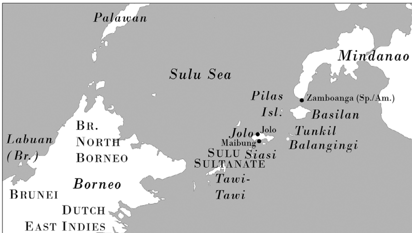
Map 2: The Sulu Sea

kingdoms to expel Muslims from the Iberian Peninsula from the eleventh to the fifteenth centuries. The Spanish consequently labelled their Muslim adversaries in the Philippines ‘Moros’, a condescending term for Muslims derived from the Mediterranean and Iberian context. From the point of view of the Spanish, and to some extent also from the point of view of the Moros, the protracted conflict was interpreted as part of a long-standing global struggle between Christianity and Islam. 1 In the course of this struggle, and as a result of increased contacts with the wider world from the sixteenth to the nineteenth centuries, the Muslim identity of the Moros was strengthened, largely in opposition to the Spanish incursions and their attempts to propagate the Christian faith. 2