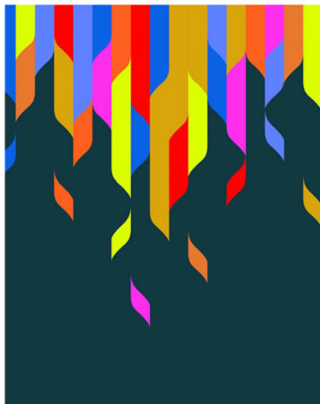
Figure 1. Sample invitation.

month prior to a PSE, we send an invitation by email (Suppl Fig 1) informing potential participants of the event and inviting them to consider sharing a story. Importantly, other than events specifically facilitated for a singular clinical discipline, all our events are intentionally interprofessional. We seek to empower a diverse group of storytellers from varied professional backgrounds, lived experience, places of work, etc. To leave space for participants to share the stories most important to them, we encourage potential storytellers to reflect on what has moved them in recent months, be it at work or at home. Rather than provide a directive, we ask the open-ended question “What can you not stop thinking about?” We do instruct storytellers to move away from traditional medical case reports, and instead focus on their emotional reactions to moments in their professional and personal lives.