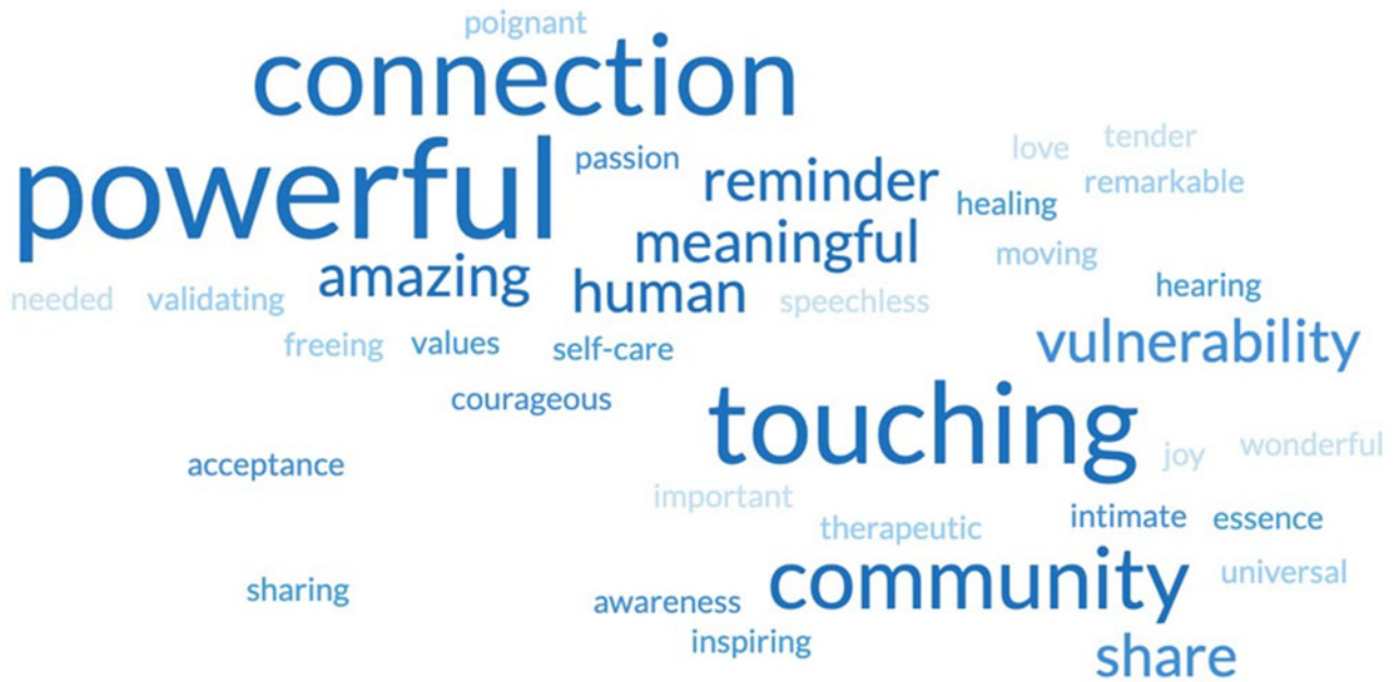
Figure 3. Themes and feedback word cloud.

health professionals' states, "The cognitive ability to give meaning and shape to stress appears to determine resilience development or maintenance." (Zanatta et al. 2020) In addition, through active listening we create psychological safety for vulnerability and narrative knowing, or the ability to create shared understanding (Buckley et al. 2018; Sandelowski 1994) which can provide affirmation and healing.