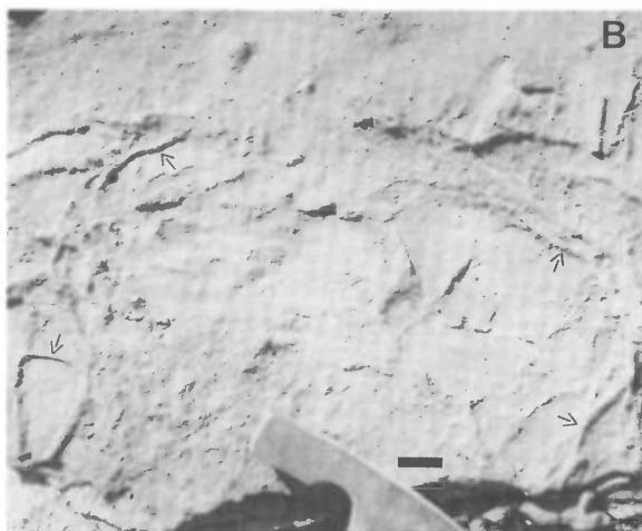
Fig. 4B. Bedding plane exposure of lower part of lacustrine sequence (Q1) at the location of the arrow shown in Fig. 3B. The bedding plane surface is covered by a dense, branching network of horizontal root casts (rhizoliths) and permineralized wood. Scale bar is 2.0 cm.

and into the stream valleys that incise the saddle area from the east and west. The eastern lobe of the flow evidently moved beyond the lateral extent of the lacustrine sequence and far enough downslope so that, in places, the distal edges actually lie at a lower elevation than the stratigraphically older lacustrine sequence. This relation is most visible in the southerly flowing stream that bounds the area to the east. At that location, erosion has stripped back the edge of the younger flow, exposing its basal contact, an irregular unconformable surface lying just above the weathered surface of the older alkalic basalts of the Lomas Coloradas Formation.