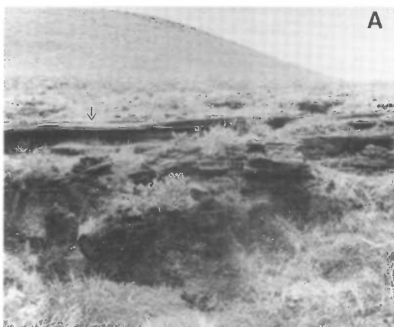
Fig. 4A. View looking southwest from creek bounding the study area on the east. Outcrop in foreground exposes well-stratified lacustrine sandstones (Q1, arrow) underlain by a cinder deposit containing coarse lapilli of fine-grained, vesicular basalt, which makes up the base of the southernmost cone (hill in background). Note the northward-dipping, low-angle cross-stratification of the lower beds of the sandstone sequence, which thicken toward the saddle area between the two cones.