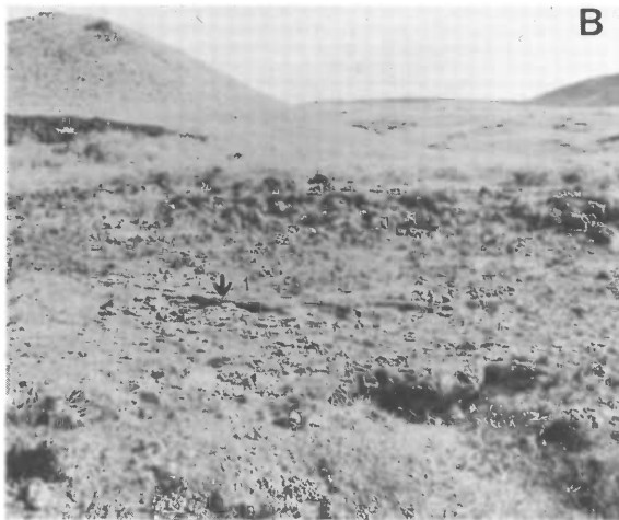
Fig. 3B. View looking northeast from within the saddle area indicated by arrow in Fig. 3A. Rock hammer to right of arrow in center of photo rests upon lacustrine sandstones (Ol) near position of oldest dated horizon (Sample 1, UCLA-2618, Fig. 2). The lacustrine deposit is overlain locally by a black vesicular basalt, Qvb, (upper left at base of cone), the stratigraphically youngest unit in the map area. This flow issued from fissures near the base of the northern cone, and flowed downslope, entering the upper part of the stream drainages that breached the cones from the east and west.

Retallack (1988) points out that fossil root traces are best preserved in formerly waterlogged sedimentary profiles. The location of the deposit in the low area between the scoria cones, the well-sorted nature of the sediment, absence of marine indicators and abundance of plant fossils, suggest deposition in a terrestrial aquatic (lacustrine) or perhaps paludal (swampy) environment, similar to the ephemeral lakes that are found within the craters of some cinder cones on the west side of Socorro Island (e.g., Lago Luna, Fig. 3 of Bryan 1959). The lacustrine units exhibit a broadly lenticular geometry and low-angle cross-bedding that dips gently to the north, toward the saddle area (Fig. 4A). The extensively developed, in-situ root networks, fine-grained and well-sorted texture of the sediments and abundance of organic material argue strongly against a pyroclastic surge origin for the sampled units.