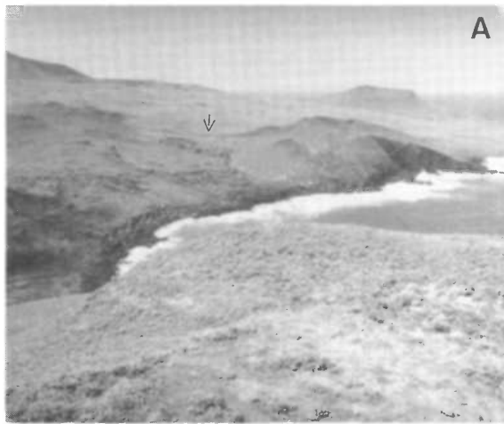
Fig. 3A. View eastward across Bahia Braithwaite from the trachyte dome just west of the "trap door" structure in Fig. 2. Arrow indicates "saddle area" between scoria cones, where dated samples were collected.