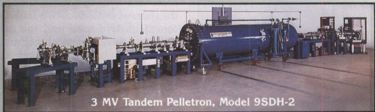
3 MV Tandem Pelletron, Model 9SDH-2

Tel. 608/831-7600 • Telex 26-5430 • Fax 608/256-4103