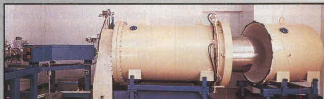
Single Ended Pelletron, Model 3UH