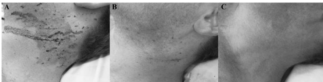
Figure 1. A , Findings on admission. Multiple small ferromagnetic bodies (0.2–2 mm) driven into the skin of the left neck and face of a young male worker when disconnecting a compressed air pipeline. B , After decontamination, wound irrigation, and magnetic scanning (steps 1–2), the amount of remained particles is marginal. C , Findings 6 weeks after the treatment. There is no scarring or remaining particles.