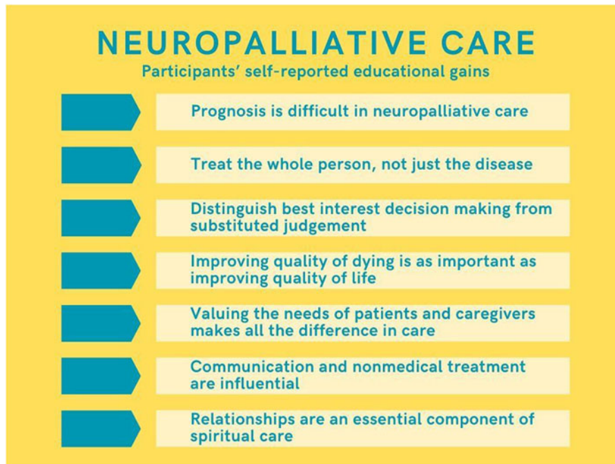
Figure 2. Participants' self-reported educational gains.

Surrogate decision-makers need good prognostication, information, and sufficient funds to manage the care. Screening tools and assessments are helpful in managing unmet needs of neurological patients and their care has to be adjusted according to disease trajectories.