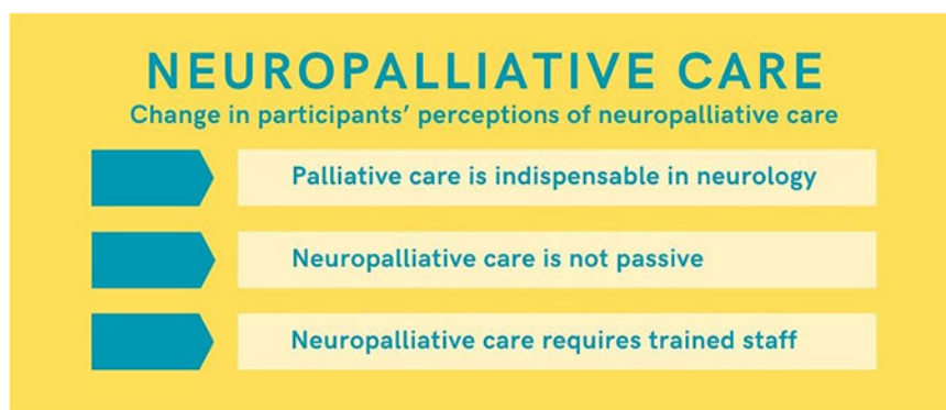
Figure 1. Change in participants' perceptions of neuropalliative care.

"After completing the course, I'm less intimidated by neurology. I feel more confident when speaking to patients and families, because at least I feel I know what I'm talking about!" (ID006)