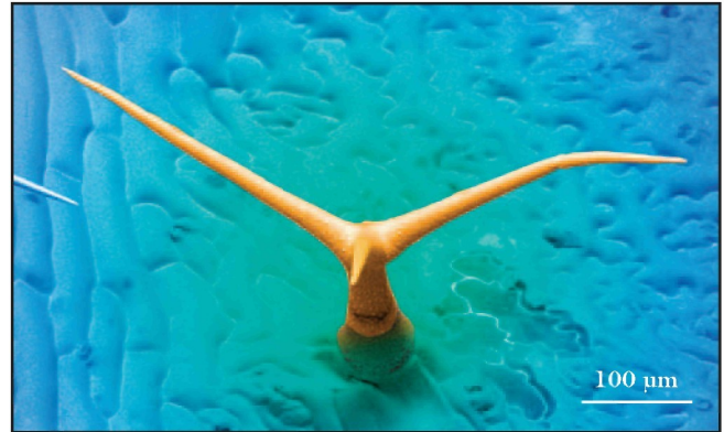
Specimen: Leaf of Arabidopsis Thaliana Instrument: Hitachi S-3500N SEM

The journey to discover and understand that which cannot be readily seen has often inspired bold exploration.