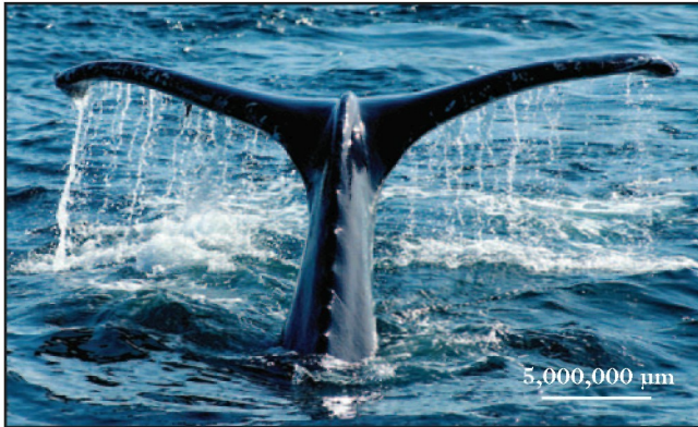
Specimen: Humpback Whale (Genus: Megaptera) Instrument: The Naked Eye