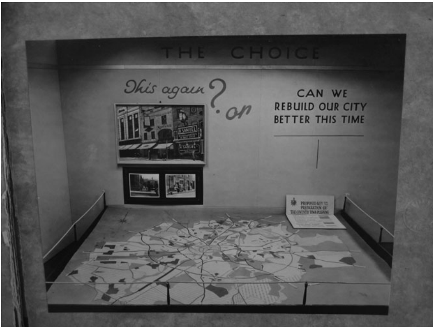
Figure 4: Photograph from the 1945 Coventry of the Future exhibition.

for redevelopment other than a vague reference to a 'garden of rest' or 'museum of medieval city development' in Spon Street. 81