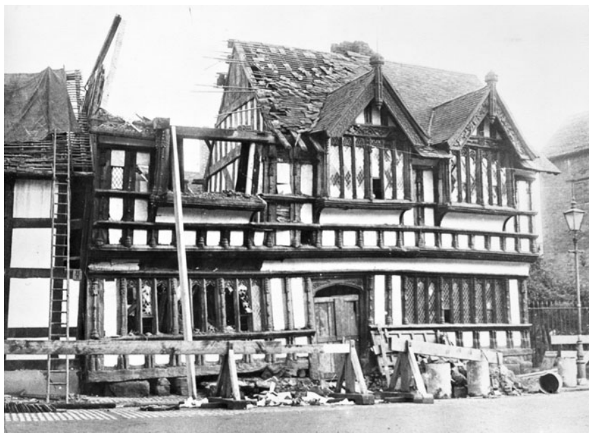
Figure 3: Bomb-damaged Ford's Hospital and adjoining listed building.

was given a temporary reprieve, but the battle to save it continued throughout the 1950s.