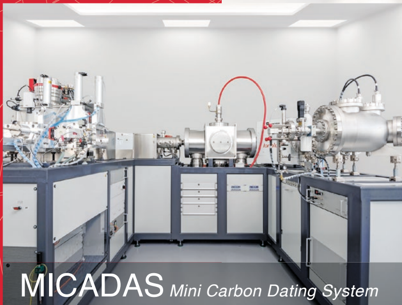
MICADAS Mini Carbon Dating System

Scientific Instruments for Radiocarbon Dating and Accelerator Mass Spectrometry