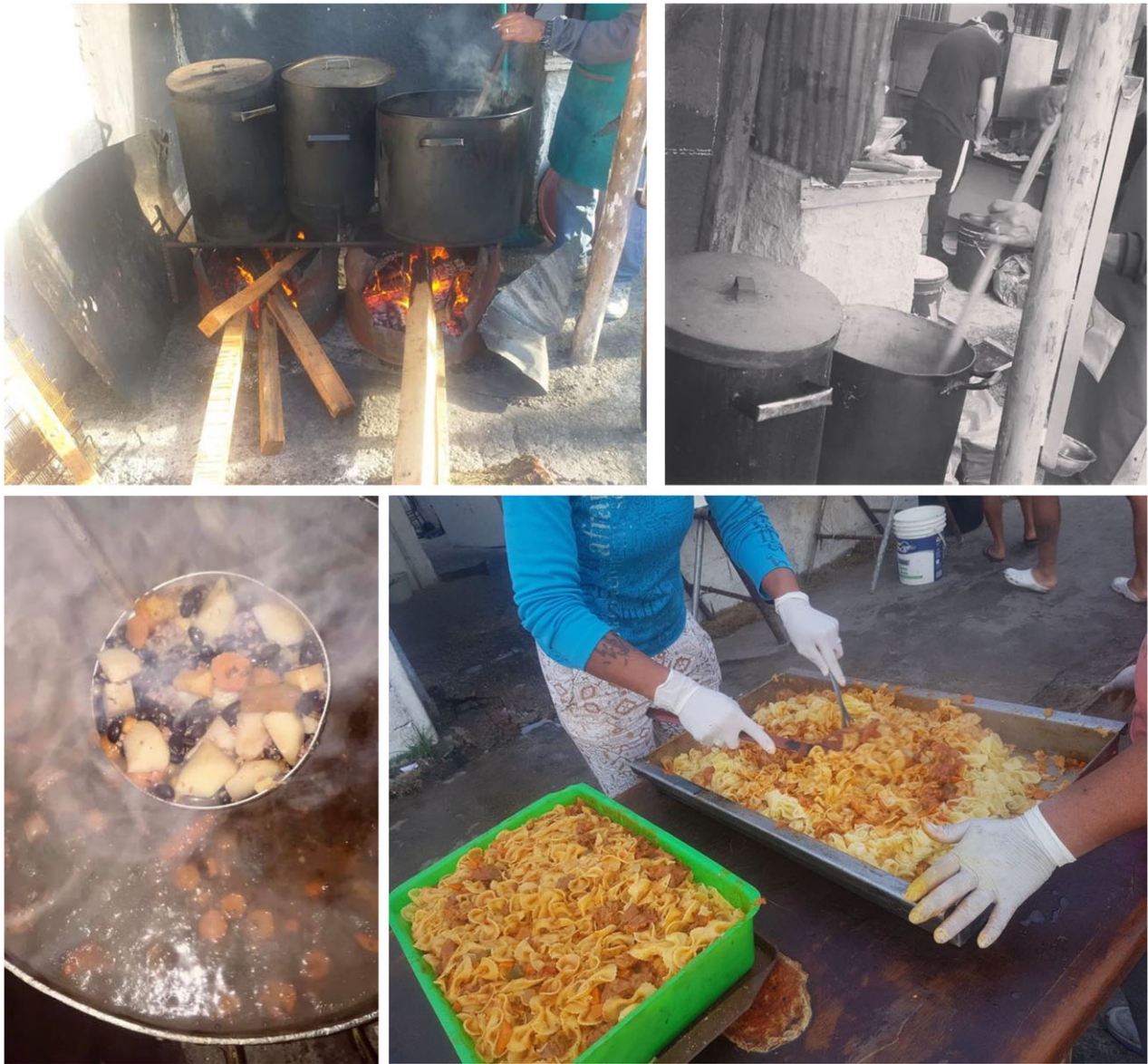
Fig. 2 (colour online) Images of community pots organised by Uruguayan civil society organisations in the context of COVID-19, retrieved from the Facebook accounts of the organisations

specific products (e.g. ‘ We receive donations of onion, pepper, tomato sauce, lentils, beans, flour and eggs ’ or ‘ Collaborate by donating oil, sugar, salt, fat, baking powder or cleaning products ’), whereas others requested any kind of donations (e.g. ‘ Second round of collection of foods and cleaning products. We will use everything we collect to prepare baskets for the families with children and adolescents that participate in our activities ’ or ‘ Sponge cake? Cookies? Scones? Bread? What is your specialty? Be part of this initiative by bringing something home-made for this Wednesday ’). Reliance on donations of foods introduced variations to the content of the food baskets provided by the organisations and the dishes prepared in the community pots.