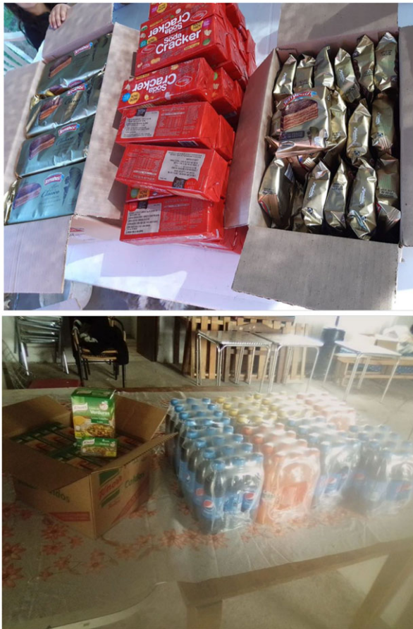
Fig. 3 (colour online) Images of donations of ultra-processed products received by Uruguayan civil society organisations in the context of COVID-19 from a food bank

'We need your help. During the sanitary emergency there are many families that cannot access basic food. We are putting together food baskets that are distributed to more than 100 families every week. How can you collaborate? (Banking information)'