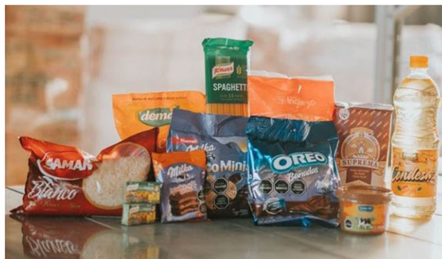
Fig. 1 (colour online) Images of food baskets distributed by Uruguayan civil society organisations in the context of COVID-19, retrieved from the Facebook accounts of the organisations

organisations received donations of ultra-processed products from food companies (e.g. soda, crackers, cookies, chocolates), as exemplified in Fig. 3.