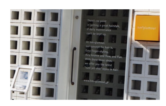
Figure 5. Monolingual English at the storefront of a hair salon in Shibuya.

Another example from Shibuya is a hair salon, as shown in Figure 5. The name of the salon displayed on the right of the entrance and the price list on a board in the bottom left are exclusively in English. Writing the price list in English is a quite common stylistic choice among Japanese hair salons, especially those targeting a young Japanese clientele. As discussed earlier, the majority of the Japanese can read basic English, sufficient for understanding price lists. This suggests that English signs do not necessarily target only an English-speaking audience; instead, their target audience depends on the social context of the sign. The door in Figure 5 displays the store's concept in English. Although it includes sentences, which requires more than basic English skills compared to reading the price list, the context surrounding this English use indicates that it primarily serves symbolic and decorative purposes. For instance,