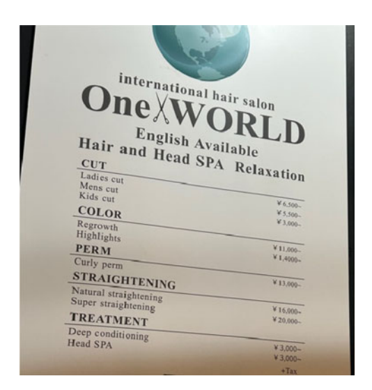
Figure 10. Monolingual English sign at a hair salon in Azabu.

Another example is the storefront of the upscale grocery store "National Azabu", which offers foods, ingredients, and