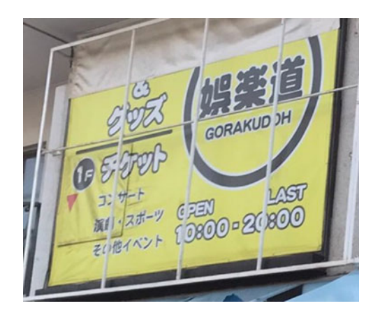
Figure 6. English on a sign at an idol goods and tickets store in Shibuya.