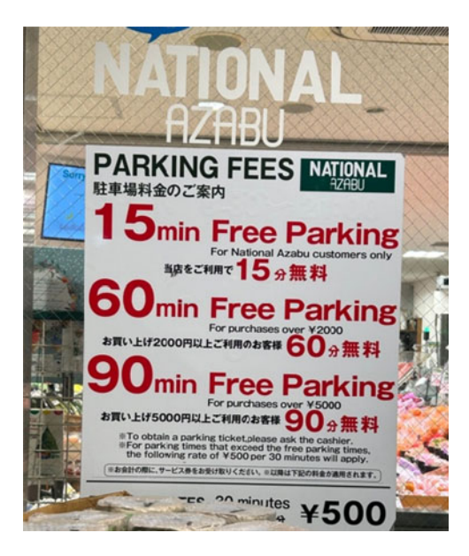
Figure 9. Bilingual English-Japanese sign at a grocery store in Azabu.

locals, depending on their understanding of English and the specific social context (Leeman and Modan 2009).