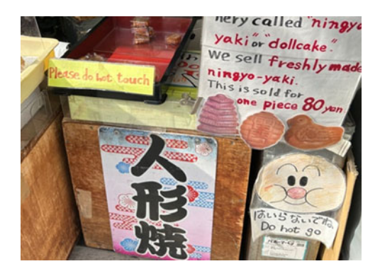
Figure 3. Handcrafted English signs in Asakusa.

fronts, as shown in Figure 2. Among these English signs hand-crafted by the individuals, you might notice some English errors, as shown in Figure 3, which displays "Do hot go" (intended to be "Do not enter", according to the corresponding Japanese text above it). This article's focus is not on