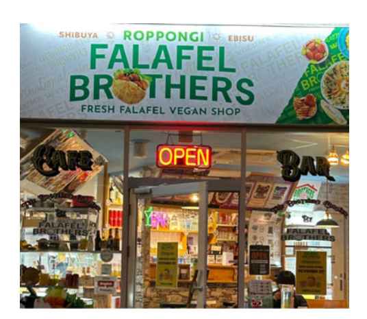
Figure 8. Monolingual English sign at a restaurant in Roppongi.

The LL of Roppongi and Azabu is characterised by the use of English for informational purposes, targeting local foreign residents, such as signs in monolingual English or with English being most prominent rather than Japanese. The presence of a U.S. military base in Roppongi since the postwar period has influenced its cityscape reflecting the need for English at stores and bars catering to English speakers. Other than local restaurants, American chain stores that can only be found in limited areas across Japan, such as "Cinnabon", "Seattle's Best Coffee", and "Hard Rock Cafe", are also present in Roppongi. Moreover, the existence of numerous embassies in Roppongi and Azabu contributes to English widely used as a lingua franca in this area. Therefore, unlike Asakusa and Tsukiji, the use of English for the local foreign resident population is commonly observed. The presence of English is prominent across the area, yet unlike Shibuya, its function is more informational, although it might also be perceived as symbolic by Japanese