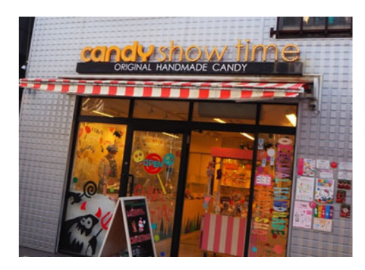
Figure 4. Monolingual English sign at a candy store in Shibuya.

In the LL of Shibuya, English is prominently used for symbolic and decorative purposes, primarily targeting Japanese locals. As Shibuya's central shopping districts cater to those in pursuit of the latest trends, from casual fashion to high-end brands, English signage is abundant in the LL. This is particularly evident around Omotesando street and its surrounding side streets, where brand stores dominate, with the presence of English signage more prominent than Japanese. The use of English includes those for brand names, products, and names of companies originating from English-speaking countries, such as "Tiffany & Co." and "Ralph Lauren". These represent examples