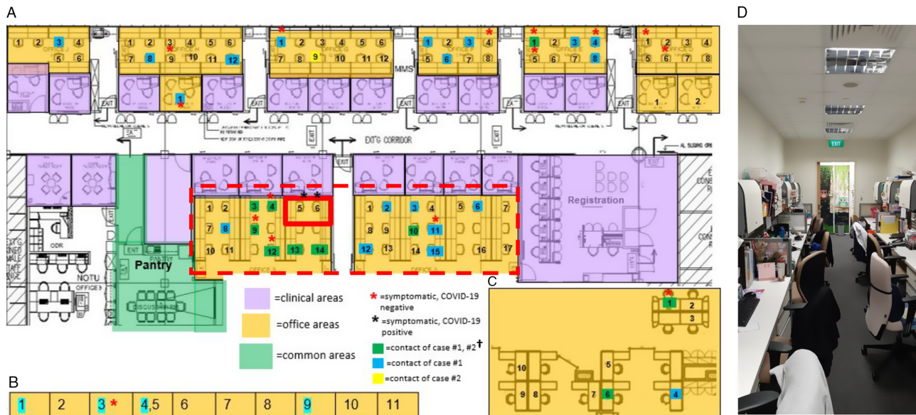
Fig. 2. Distribution of healthcare workers (HCWs) with significant contact history, symptomatic HCWs, and office layout, during detection of a cluster of COVID-19 cases among HCWs. (A) Main medical social services office layout. (B) Series of single-room offices used by senior medical social workers located on the same floor. (C) Off-site medical social services office located in another office tower. (D) Typical layout in main medical social services office at the time of the outbreak. A total of 49 staff were placed on quarantine (home isolation) based on significant unprotected contact with the 2 cases. Of these 49 staff, 10 had significant unprotected contact with both case 1 and case 2; 23 staff had significant unprotected contact with case 1 only; and 1 had significant unprotected contact with case 2 only. An additional 15 staff did not report significant unprotected contact, but because they shared an enclosed office space with case 1 (dotted line), they were deemed to be at higher risk of exposure and were also placed under quarantine.

Among the 14 HCWs with COVID-19, 4 clusters were linked through epidemiology investigations. Of the 4 clusters, most were likely linked via transmission outside the hospital. One cluster was a family cluster (1 doctor and 1 researcher), and 2 clusters among hospital cleaners consisted of HCWs who shared off-site accommodation (single room with en suite bathroom) but worked in different hospital areas and did not mingle while at work. A cluster of 2 MSWs with COVID-19 and suspected intrahospital spread was detected at the end of week 11 on March 13, 2020, as part of epidemiology investigations. The results of syndromic surveillance and heat maps in the period leading up to the detection of the cluster are shown in Figure 1. The 2 MSWs shared the same office and did not interact with each other outside of work; hence, this constituted a COVID-19 cluster with probable HCW-HCW transmission within the hospital in a non-clinical area.