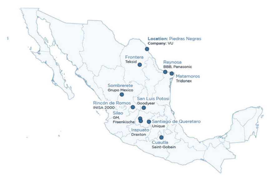
Figure 2. Most US Rapid Response Labor Mechanism situations have targeted Mexico's automobile supply chain Note : With the exception of INISA 2000 (textiles) and Grupo México (mining), all facilities are in the automobile sector.

seeking new representation: After winning the vote, the new union negotiated a collective bargaining agreement in May 2022 that included an 8.5% wage increase the first year. Less than a year later, it negotiated another 10% wage increase. (The inflation rate in Mexico was 7.4% in 2021 and 7.8% in 2022.)