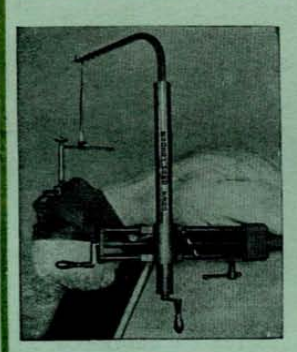
GRANDS PRIX: Paris 1900, Brussels 1910, Buenos Aires 1910.