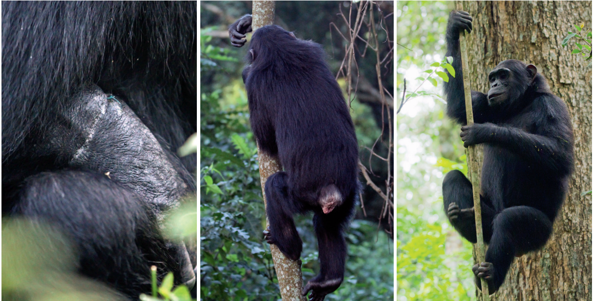
Special two months after intervention (left and middle) and gripping a branch three months after intervention (right).