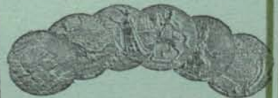
Gold Medal (Highest Award), Allahabad 1910.

GRANDS PRIX: Paris 1900, Brussels 1910, Buenos Aires 1910