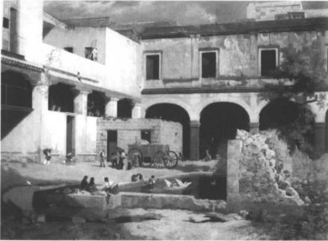
Patio del ex convento de San Augustin, 1861, José María Velasco.