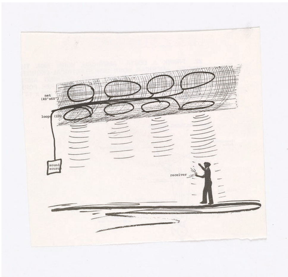
Figure 4. Steve Paxton, drawing of radio loop system for Physical Things , 1966. (Getty Research Institute, Los Angeles; 940003)

small actions while infrared cameras cast their images onto a large screen. The audio component for this section of Rauschenberg's work was twofold: First, tape recorders that had captured the racket in the first section now played those sounds back, as if the match were continuing in the dark. 5 Second, the audience heard a tape of voices that had been recorded immediately before the performance, wherein each extra spoke their name into a microphone. In my interpretation, Rauschenberg wanted to activate the enormous space of the Armory by flooding it with a crowd of performers, but he interrupted this intention in a characteristically Rauschenbergian way by killing the lights and displacing the activation into the sonic register, where a string of names droned on in an endless spoken sequence substituting for the spectacle of a crowd that could, if visible, have been apprehended in an instant.