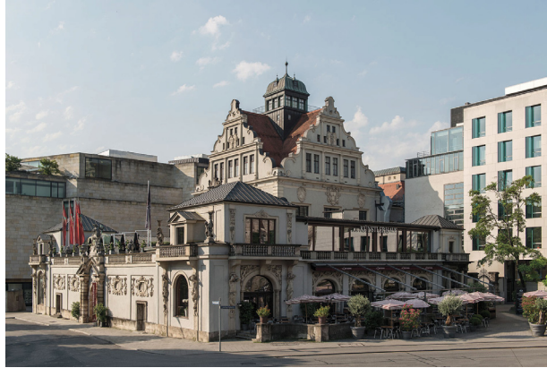
Figure 2. Künstlerhaus at the Lenbachplatz, Munich.

quoting a few passages: ‘There seems to be a case for a less formal gathering, which we may conveniently term a Colloquium, on a level intermediate between those of the formal Symposium and the private visit. The subject matter to be discussed would either be more specialised than that generally chosen for a formal symposium, or at a less developed stage; the scope would be such that the participants, invited because they have something to contribute, can all be expected to follow the discussion fully. The Colloquium should restore the immediacy and directness of personal contact in lively and spontaneous debate on current work by people personally engaged on it, from which considerations of prestige are absent. The Colloquium should help to reduce the isolation of the working scientist which tends to result from the continual and rapid ramification of subjects, and it should lead him to notice aspects of his problem which he would otherwise have ignored (. . .)’.