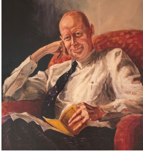
Figure 4. David Crighton (1942–2000).