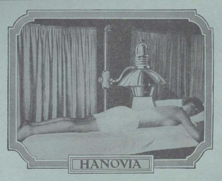
HANOVIA Pioneer in Quartz Light Therapy.