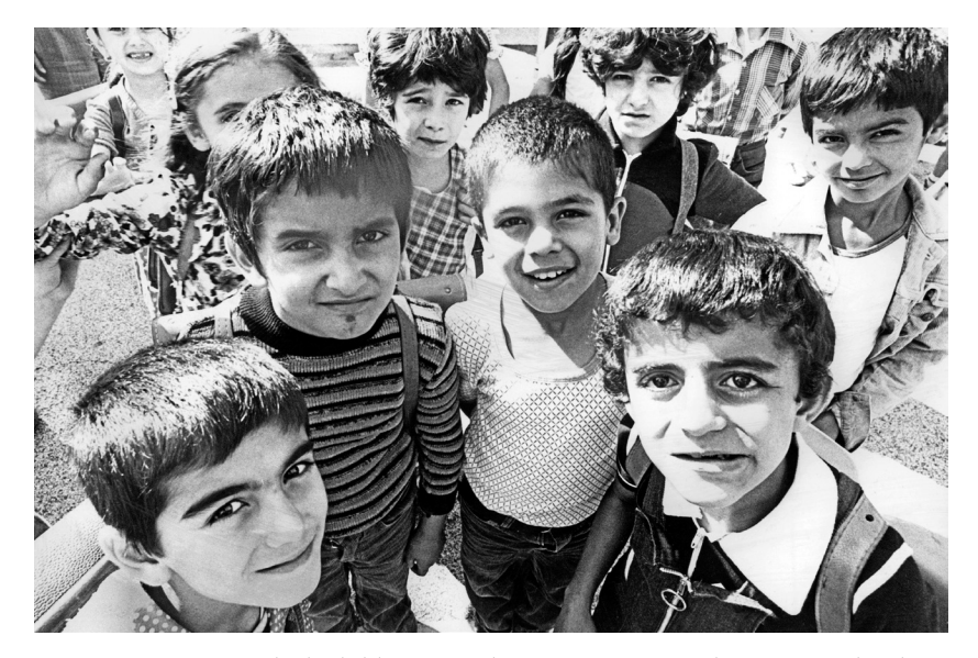
FIGURE 1.6 Turkish children outside a West German elementary school in Duisburg-Hamborn.

of all children left behind, as many found advantages, and even power, in their situations. ^{\tt II9}