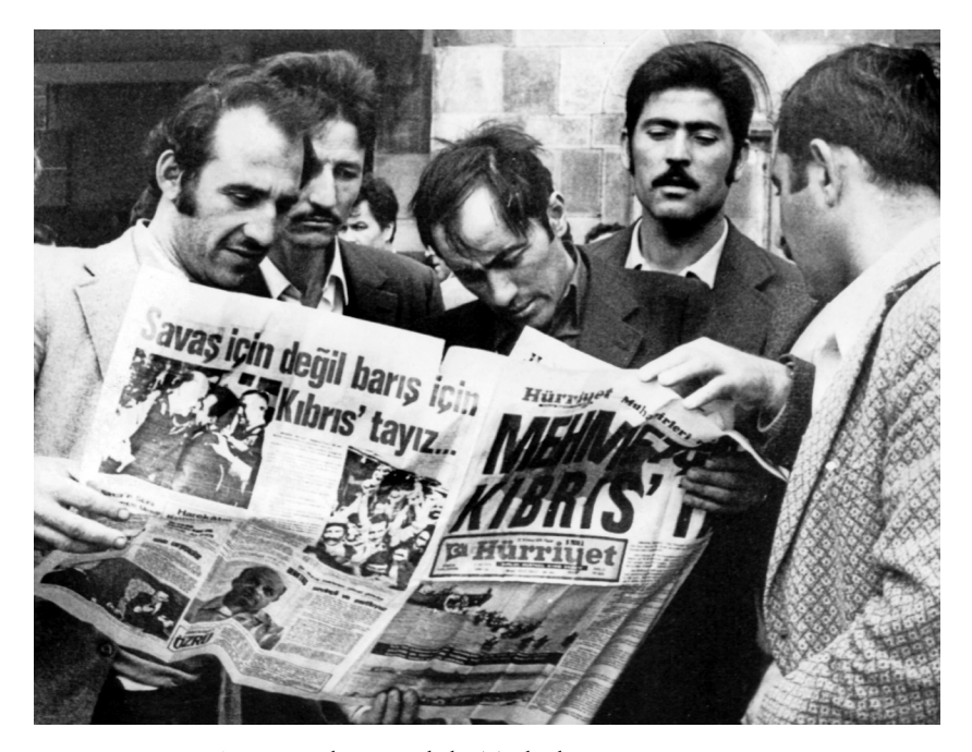
FIGURE 1.2 Guest workers read the Turkish newspaper Hürriyet at a train station in Hanover, 1974.

a time before the proliferation of Turkish coffee houses opened by guest workers seeking self-sufficiency, train stations were a last resort. Back then, Mahir explained, "We had no other places."<sup>22</sup>