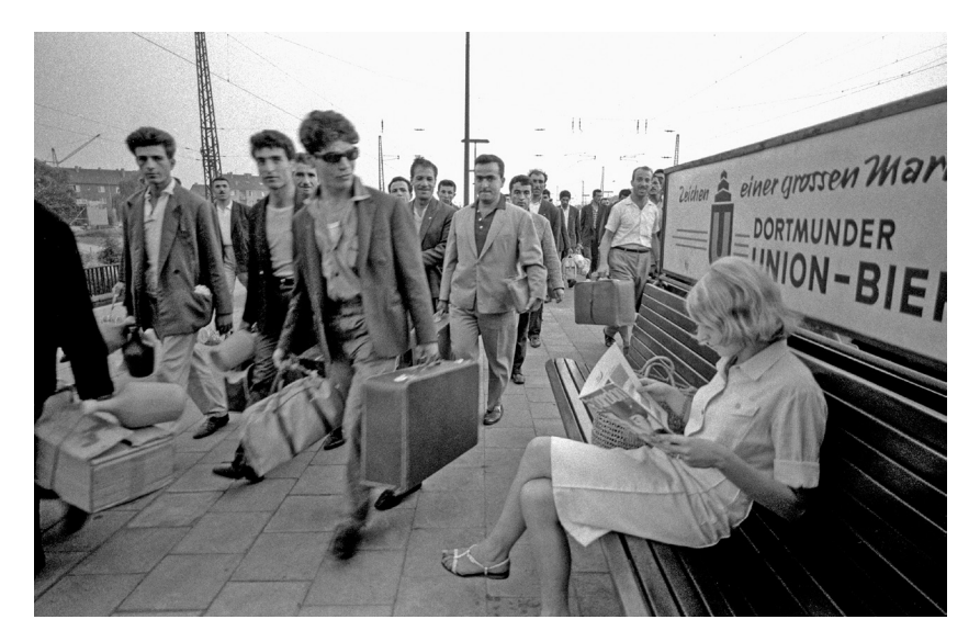
FIGURE 1.5 Male guest workers walk past a blonde German woman with a short skirt upon their arrival in Dortmund, 1964.

Beyond the transnational discourses, concerns about sex were central to guest workers' everyday lives. Alongside homesickness and isolation, male guest workers often complained about sexual malaise, with one man calling himself "psychologically ill" due to the lack of physical and emotional intimacy.<sup>69</sup> Another young guest worker was so starved for sex that he admitted having to restrain himself from touching a German woman on a streetcar, confessing that she was so "beautiful" and "free" and "smell[ed] so good."70 Married guest workers were further constrained by their vows, as well as Turkish law, which expressly forbid adultery. Not until the rise of family reunification in the 1970s, when guest workers increasingly brought their spouses to Germany, could they have sex within marriage on a regular basis. If a guest worker alone in Germany wished to have sex with their spouse, they would have to wait until they traveled back to Turkey on vacation, which usually took place just once per year. In 1975, a Turkish midwife in the small village of Calapverdi explained that the ability to have sex only during their summer vacations drastically impacted birthrates in guest workers' home