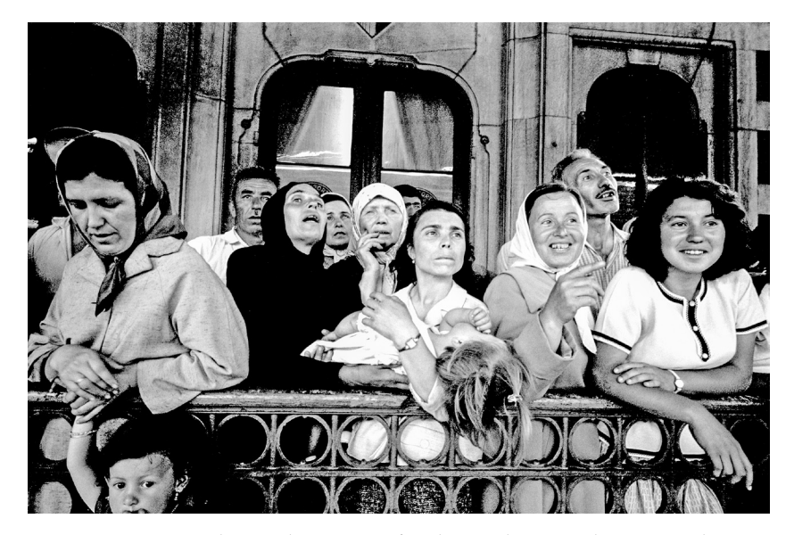
FIGURE 1.1 With mixed emotions, family members watch guest workers depart for Germany at Istanbul's Sirkeci Train Station, 1964.

For those who survived the arduous recruitment process, then came the scene of departure, full of tearful goodbyes at Istanbul's Sirkeci Train Station (Figure 1.1). Friends, parents, aunts, uncles, spouses, and children all crowded together, reaching over the wooden gates for one last hug and kiss. "We'll miss you! Send us a color photo from Germany!" they shouted.<sup>3</sup> Only those from Istanbul enjoyed the luxury of being present on the platform. Others, from all throughout the vast country, had already said their goodbyes. As the train door shut, they strained their necks to look upward at the windows, catching a final glimpse before the departure. Some embarking on the journey waved excitedly back, while others stared wistfully into the distance, wondering if they would soon regret their decision. The stay in Germany was only supposed to last two years, but neither the guest workers nor their loved ones knew when they would be reunited. They hoped that the happy day would come soon.