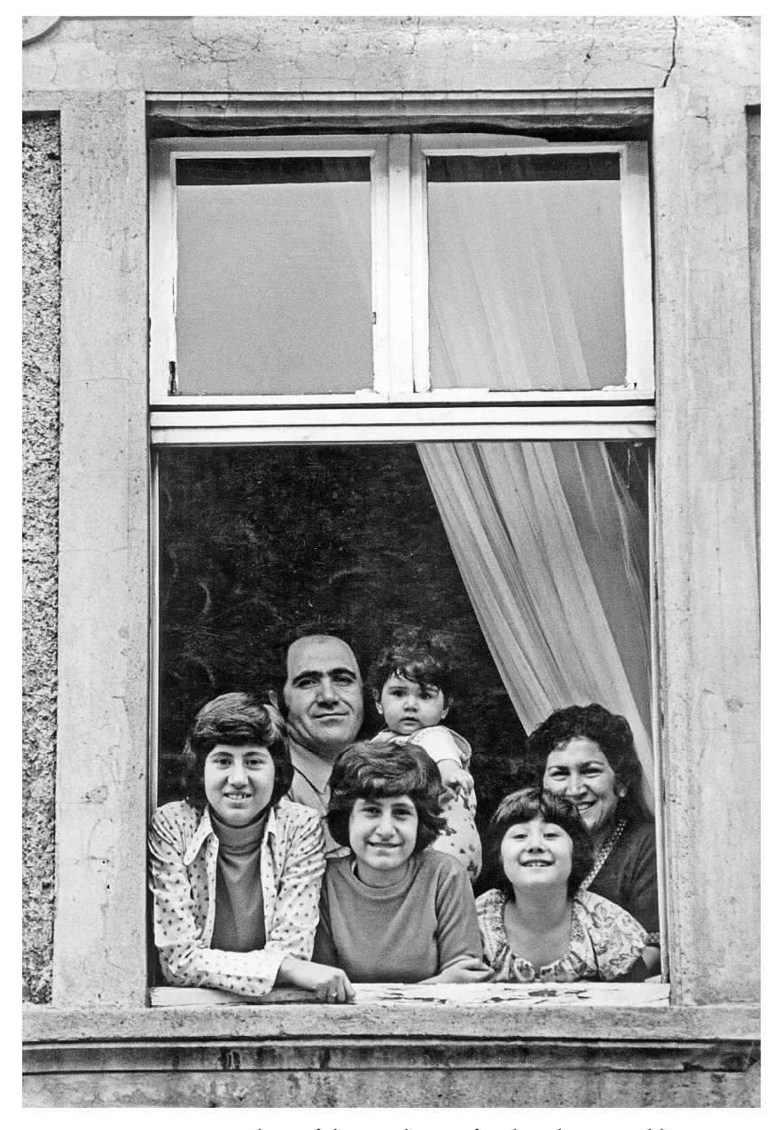
FIGURE 1.4 Members of the Dağdeviren family, who were able to migrate through West Germany's family reunification policy, smile from their apartment window in Munich, 1969.