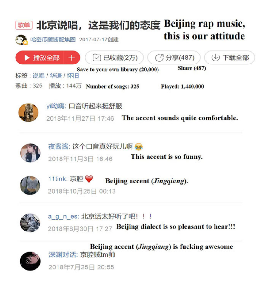
FIGURE 1. Most-played Beijing rap playlist on NetEase Cloud Music, with sample comments.

by Beijing rappers, what social meanings are attached to them, and how, as an enregistered variety of Chinese, this urban vernacular aligns with this musical genre.