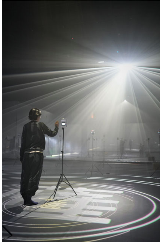
Fig. 1 Temperature monitors reflected and multiplied on the mirrored walls of the Studio Theatre in Bach Is Heart Sutra . May 2021. Cultural Centre, Hong Kong.

reminder of the pandemic and the proliferation of biometric technologies brought the city inside the theatre. Images of densely packed skyscrapers and the sea waves surrounding them were projected on the floor, bringing the city further into the space and evoking the physical topography of Hong Kong as an archipelago of over 200 islands. There was a feeling of being embodied by the city, rather than occupying it as an external environment.