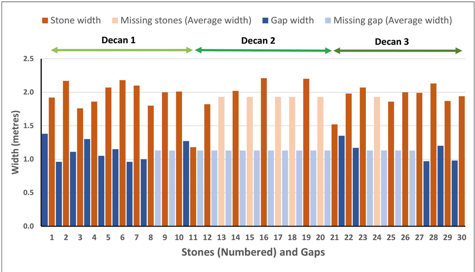
Figure 4. Plot showing the spacing and size of stones forming the Sarsen Circle (figure by T. Darvill).