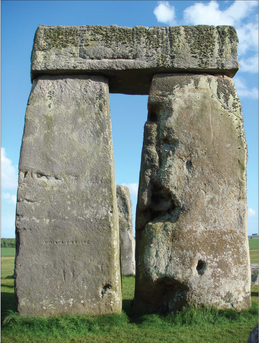
Figure 5. Trilithon S53 and S54, with lintel S154, showing contrasting pairs of smoothed and rough uprights. View looking outwards from the inside of the Trilithon Horseshoe.