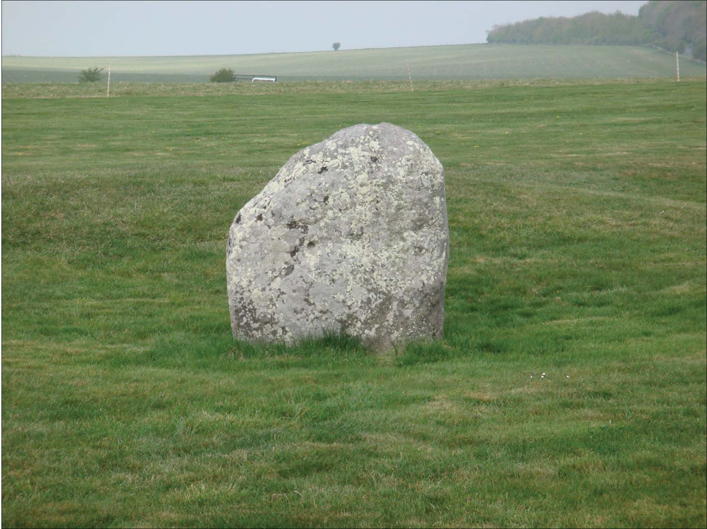
Figure 7. Surviving Station S93 at the south-west corner of the Station Stone Rectangle.

The core of the year is represented by the Sarsen Circle. Here, each of the 30 uprights represents a solar day within a repeating 30-day month. Running sun-wise from the main axis, with S1 representing Day 1, S11 and S21 become significant, as they divide the month into three ‘weeks’ or ‘decans’, each of 10 days; the anomalous stones mark the start of the second and third decans. Twelve monthly cycles of 30 days, represented by the uprights of the Sarsen Circle, gives 360 solar days. While no stones within the central setting can specifically be identified with the 12 months, it is possible that the poorly known stone settings in and around the north-eastern entrance (Cleal et al. 1995: fig. 156) somehow marked this cycle.