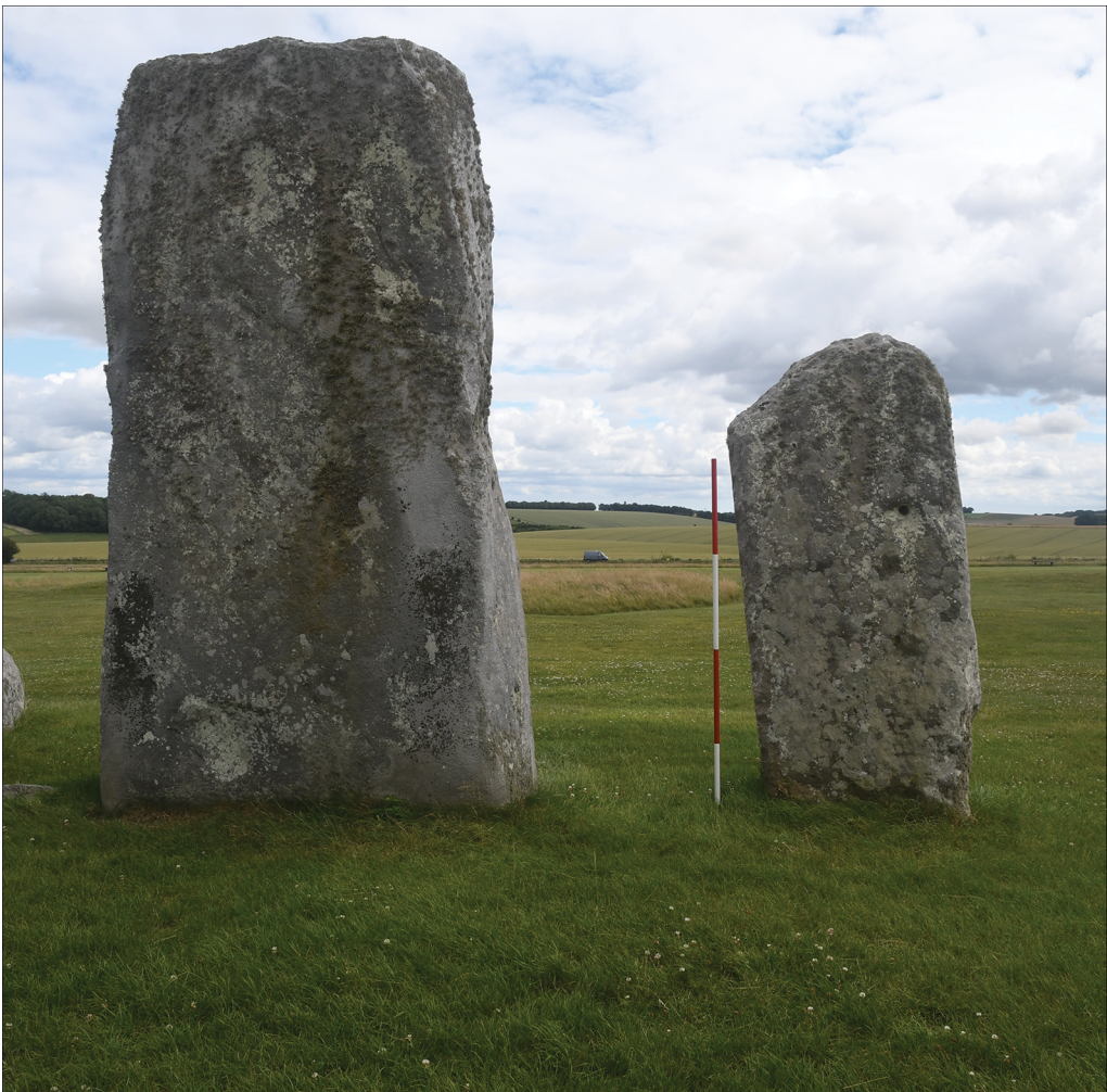
Figure 2. Sarsen stone S10 (left) in the Sarsen Circle, with the small-sized S11 to the right. View looking outwards from inside the circle. Scale = 2m.

The extant Sarsen Circle demonstrates the intricacy of its construction. The spacing of the pillars is fairly regular, but the gap between S1 and S30 to the north-east is larger than average, at 1.38m, suggesting that this was an entrance; as S15 is missing, it is difficult to judge whether there was a correspondingly wide gap to the south-west. Most of the uprights are uniform in shape and size, the 'standard width' being approximately 1.9m, measured 1.5m above ground level. Two uprights, however, stand out. S11 (Figure 2) in the south-