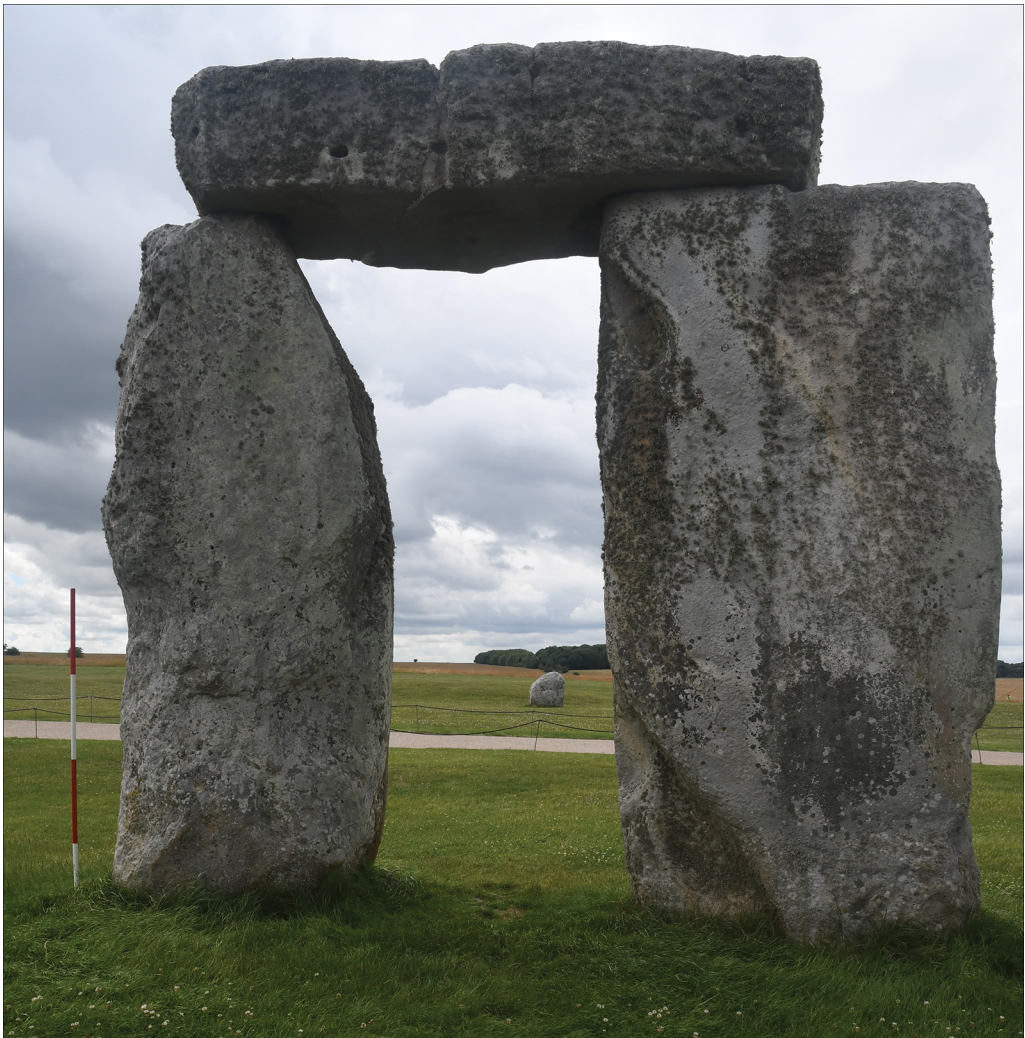
Figure 3. Small-sized sarsen stone S21 (left) in the Sarsen Circle, with the normal-sized S22 to the right. View looking outwards from inside the circle. Scale = 2m.

eastern sector is notably narrower, at 1.1m wide; it is also thinner and shorter than most, although recent work suggests that its top has been broken off (Abbott & Anderson-Whymark 2012: 50). S21 (Figure 3) in the western sector appears complete but is narrower, at 1.5m wide, and thinner than average. Figure 4 shows the pattern of stone widths and gaps around the circumference of the Sarsen Circle. Although the six missing uprights lie in the south-western sector of the circle, the size of their sockets—known through excavation or parch-marks—suggest they were ‘standard width’ stones. Counting sun-wise from S1, there seem to be three distinct groups of ten uprights: S1–10, S11–20 and S21–30. Each group is preceded by a slightly wider-than-usual gap, with S11 and S21 standing out due to their smaller size.