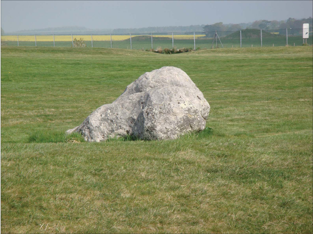
Figure 6. Surviving Station S91 at the north-east corner of the Station Stone Rectangle.

Rectangle run parallel to the principal axis, albeit displaced to the north-west and south-east. Ruggles (1997: 218–21) has suggested that the two long sides of the rectangle are approximately orientated on major extreme moonrise positions, but whether deliberately or by chance remains unclear.