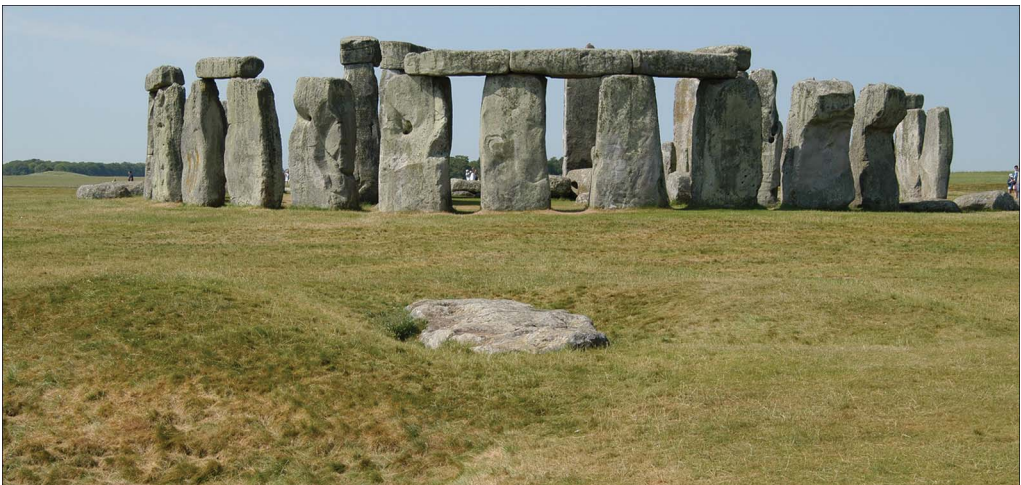
Figure 1. Stonehenge, viewed from the north-east, showing the post-and-lintel construction of the Sarsen Circle.

The most visually prominent structure at Stonehenge is the ring of 30 upright sarsen stones, linked at the top with 30 lintels (Figure 1). The uprights are conventionally numbered S(tone)1 to S30 in clockwise fashion, starting at the north-east. Seventeen of the uprights are still standing in their original positions, seven are extant but fallen and six are missing. Six lintels remain in place atop their supporting uprights, while two fallen examples lie on the ground; 22 are missing. Although the missing stones have sometimes been suggested to indicate that the Sarsen Circle was never completed (e.g. Ashbee 1998), sockets for some fallen or missing uprights are known through excavation (Cleal et al. 1995: 192–