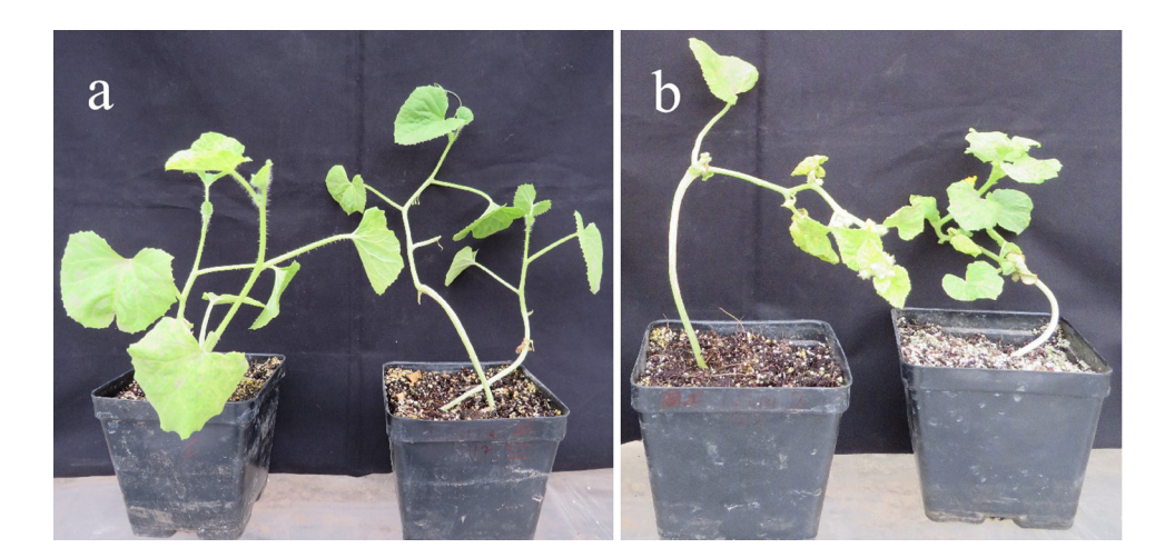
Figure 1. ToLCNDV symptoms observed on F_2 plants derived from Pusa Sarda × DSM-19 under challenge inoculation: (a) resistant F_2 plants, (b) susceptible F_2 plants.