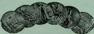
Gold Medal Allahabad 1910.

Paris 1900, Brussels 1910, Buenos Aires 1910.