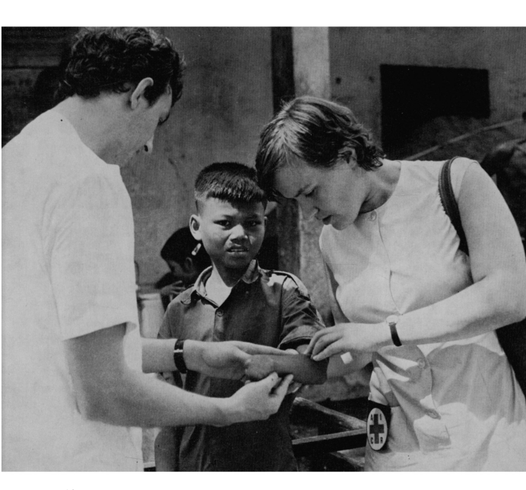
Khmer Republic: Belgian Red Cross doctors at Svay-Rieng examining the arm of a boy whose hand had to be amputated after a grenade explosion.